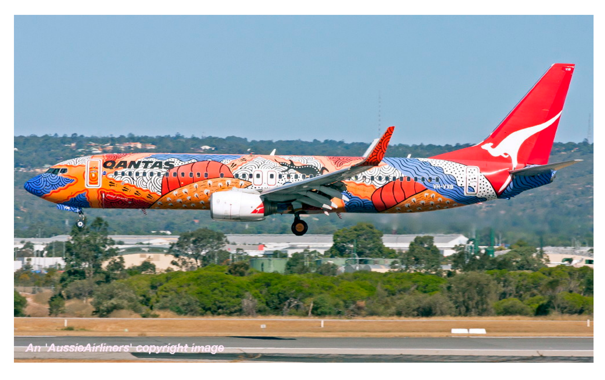
VH-VXB 'Yananyi Dreaming' in the aboriginal livery at Perth Airport, November 19, 2013.