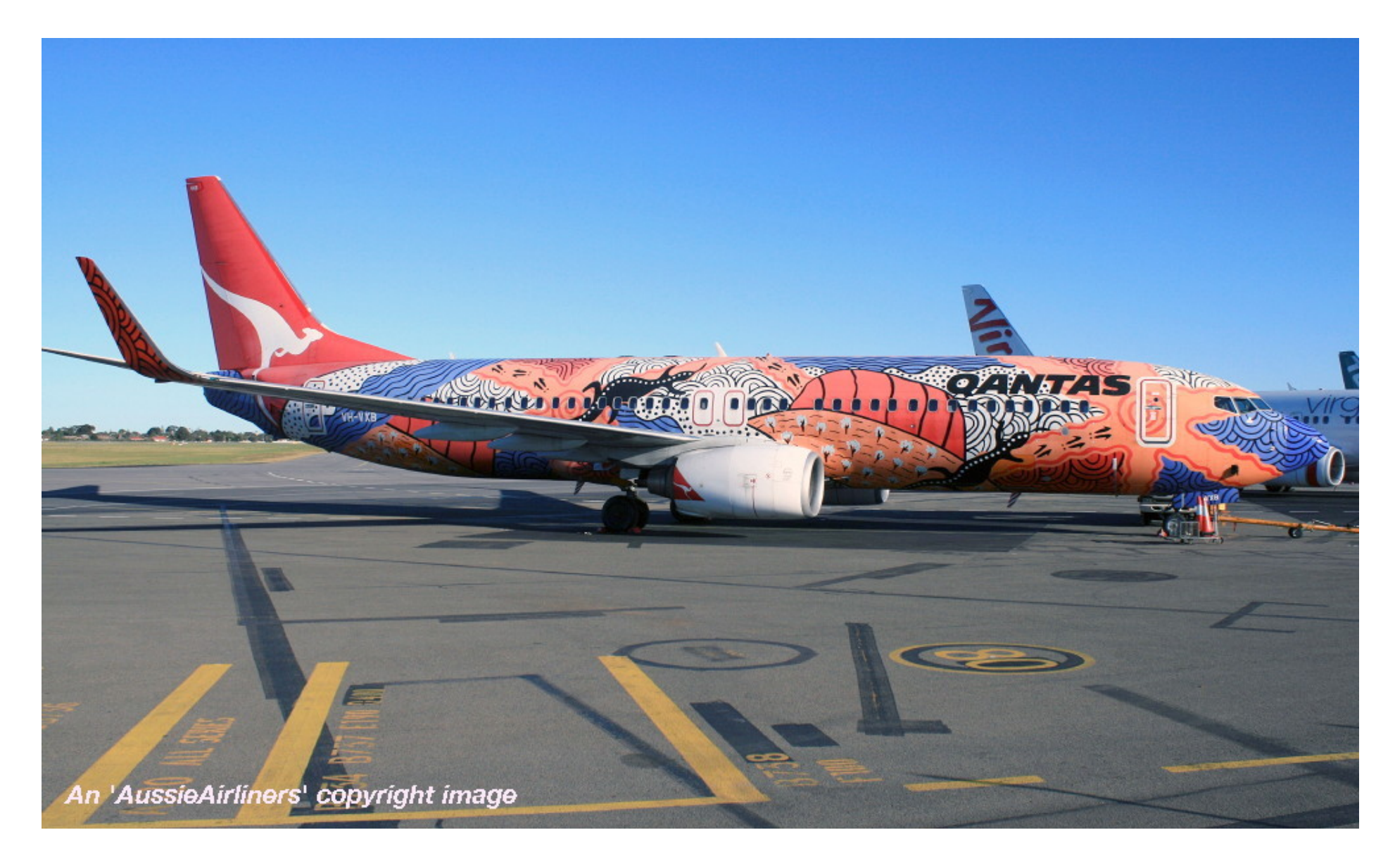
VH-VXB 'Yananyi Dreaming' in the aboriginal livery at Adelaide West Beach Airport, September 07, 2014.