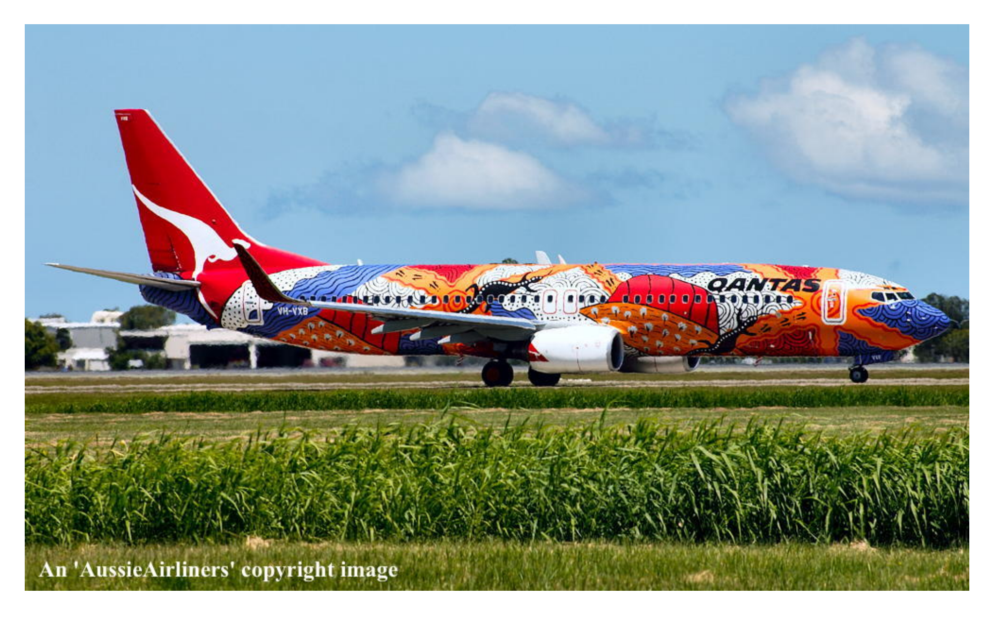
VH-VXB 'Yananyi Dreaming' in the aboriginal livery at Brisbane Airport, January 16, 2005.