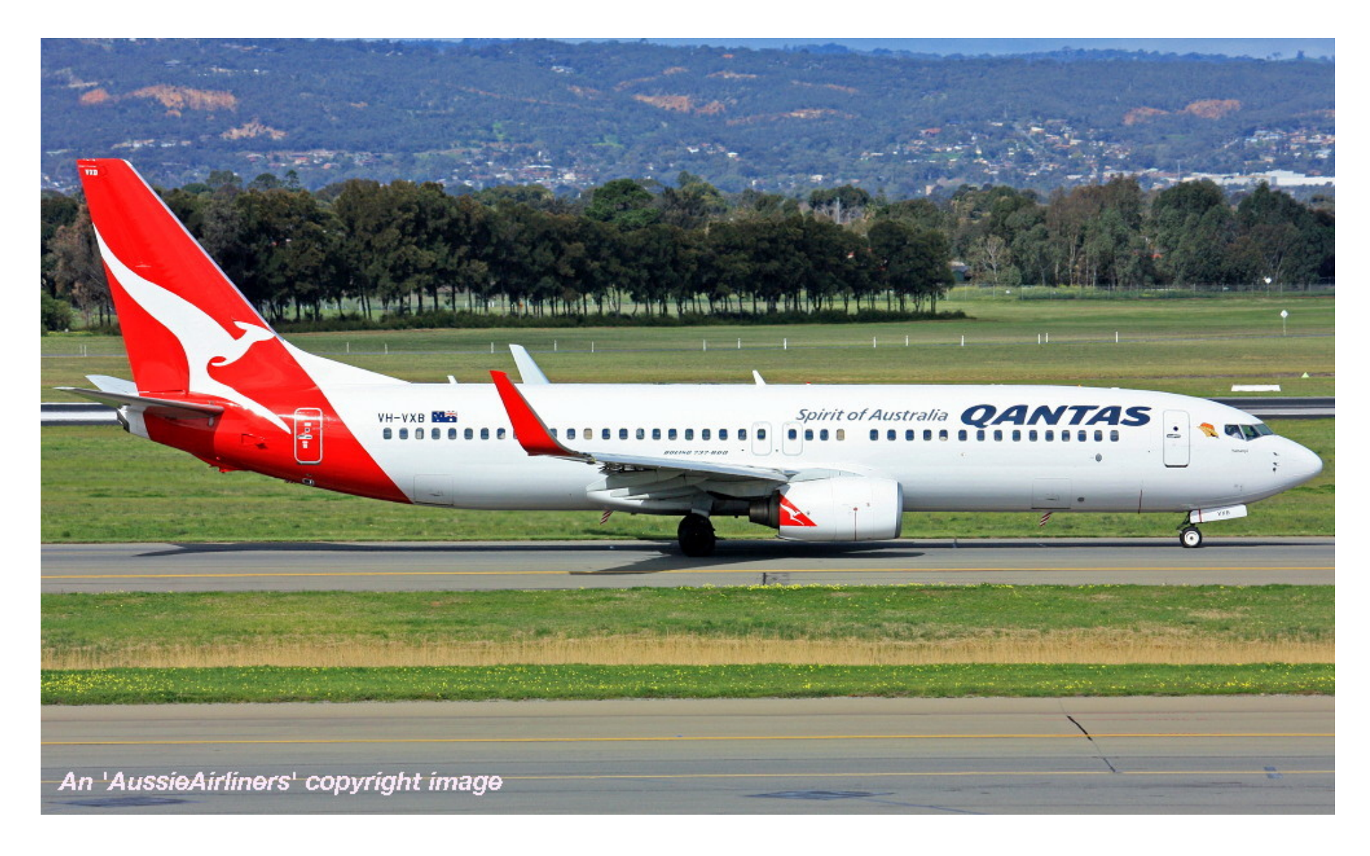
VH-VXB 'Yananyi' in the 'New Roo' livery at Adelaide West Beach Airport, August 23, 2015.