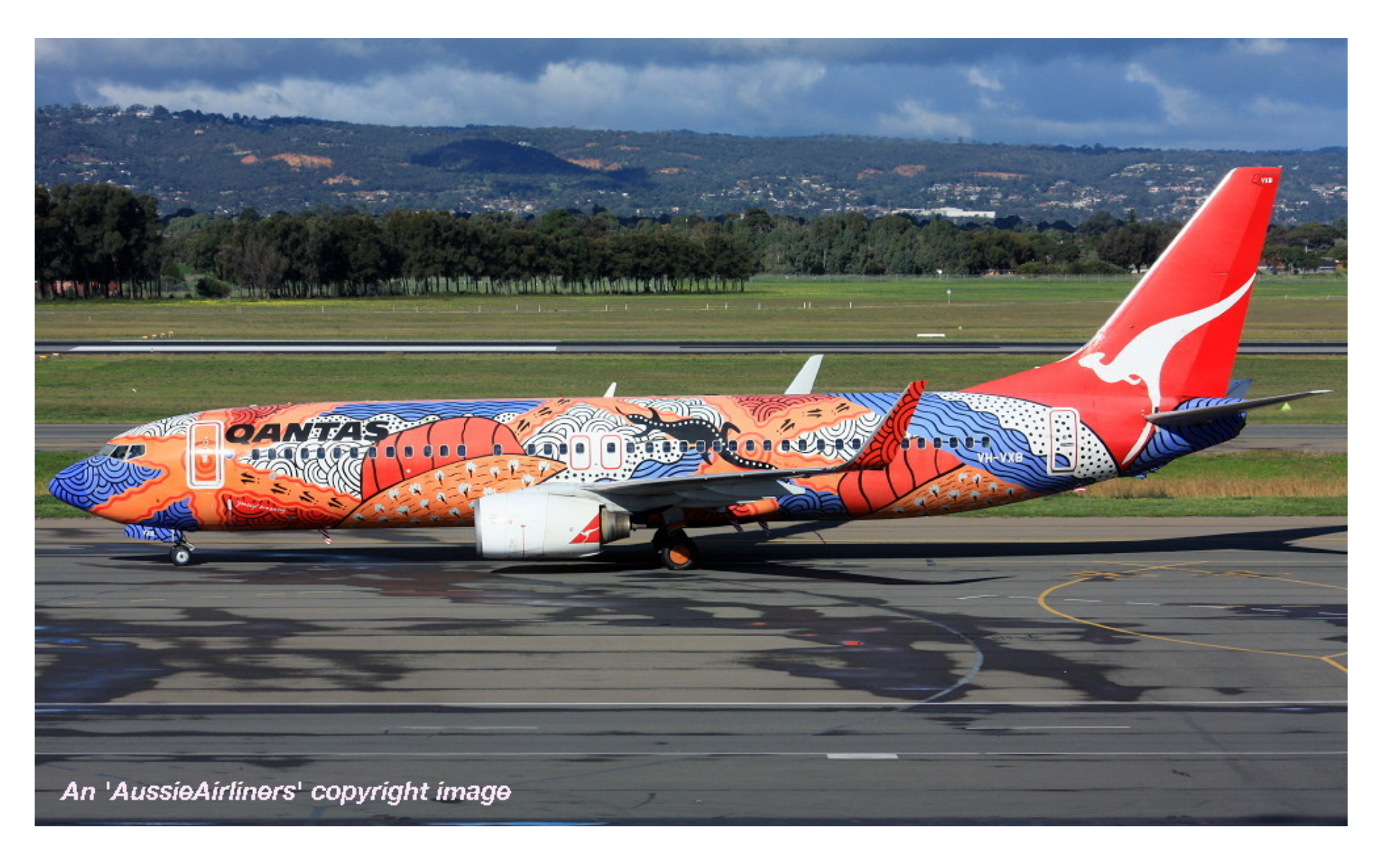
VH-VXB 'Yananyi Dreaming' in the aboriginal livery at Adelaide West Beach Airport, June 15, 2014.