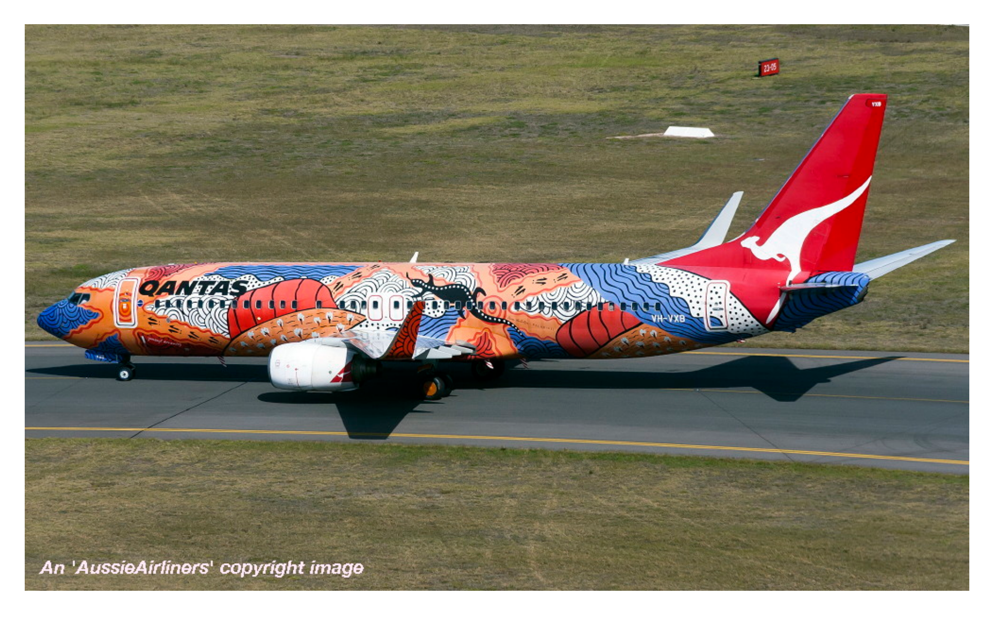
VH-VXB 'Yananyi Dreaming' in the aboriginal livery at Adelaide West Beach Airport, April 20, 2014.