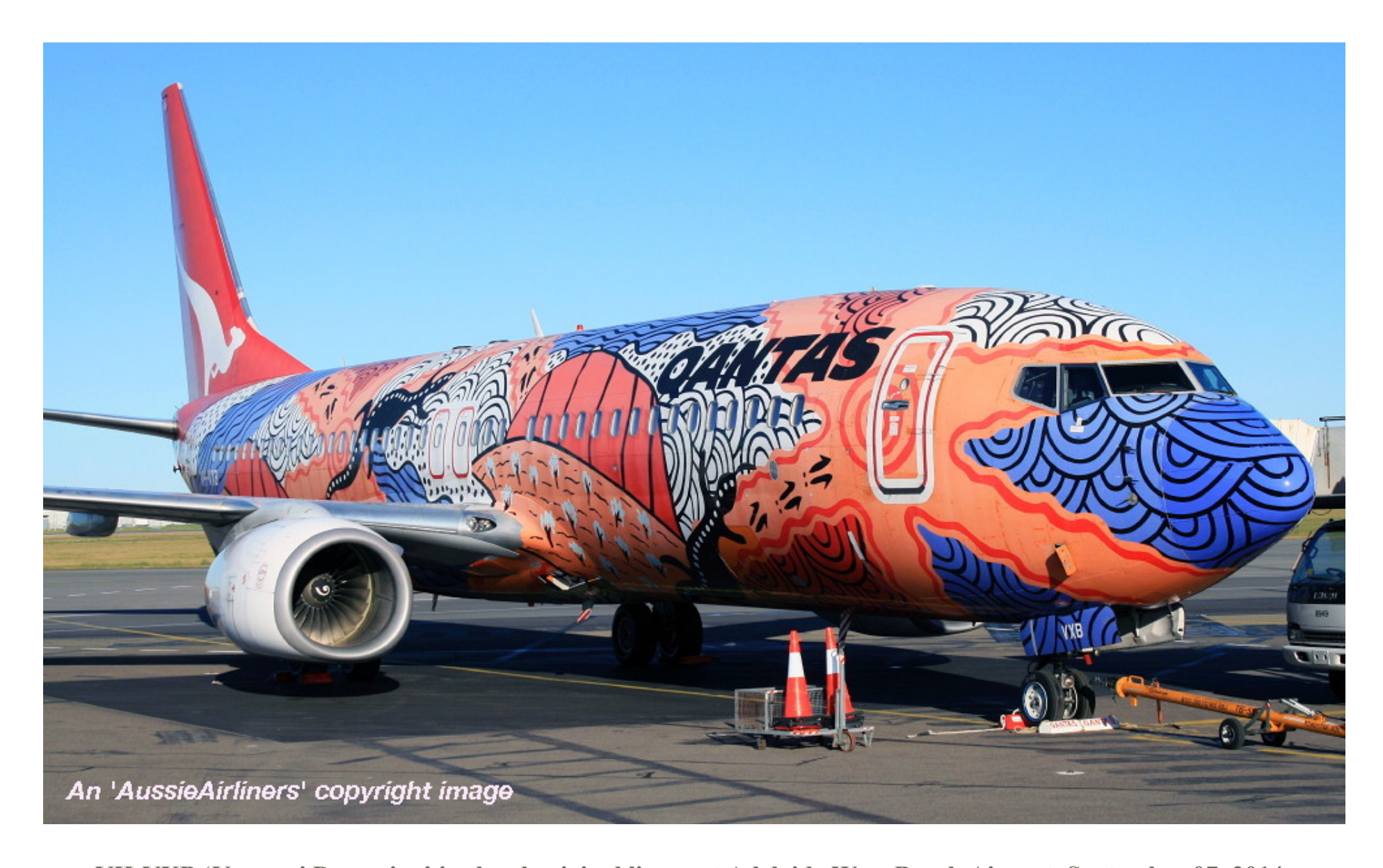
VH-VXB 'Yananyi Dreaming' in the aboriginal livery at Adelaide West Beach Airport, September 07, 2014.