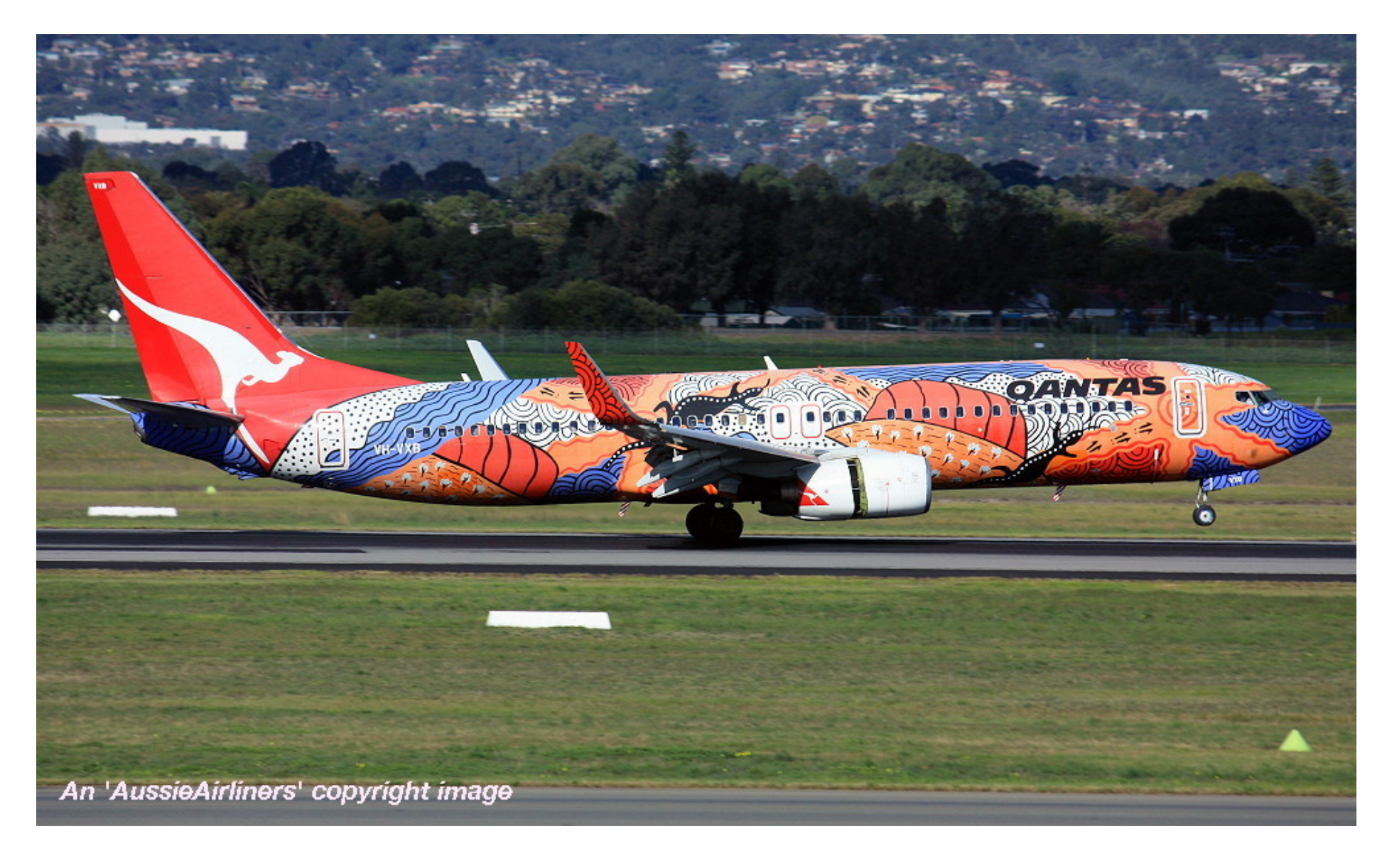
VH-VXB 'Yananyi Dreaming' in the aboriginal livery at Adelaide West Beach Airport, June 15, 2014.