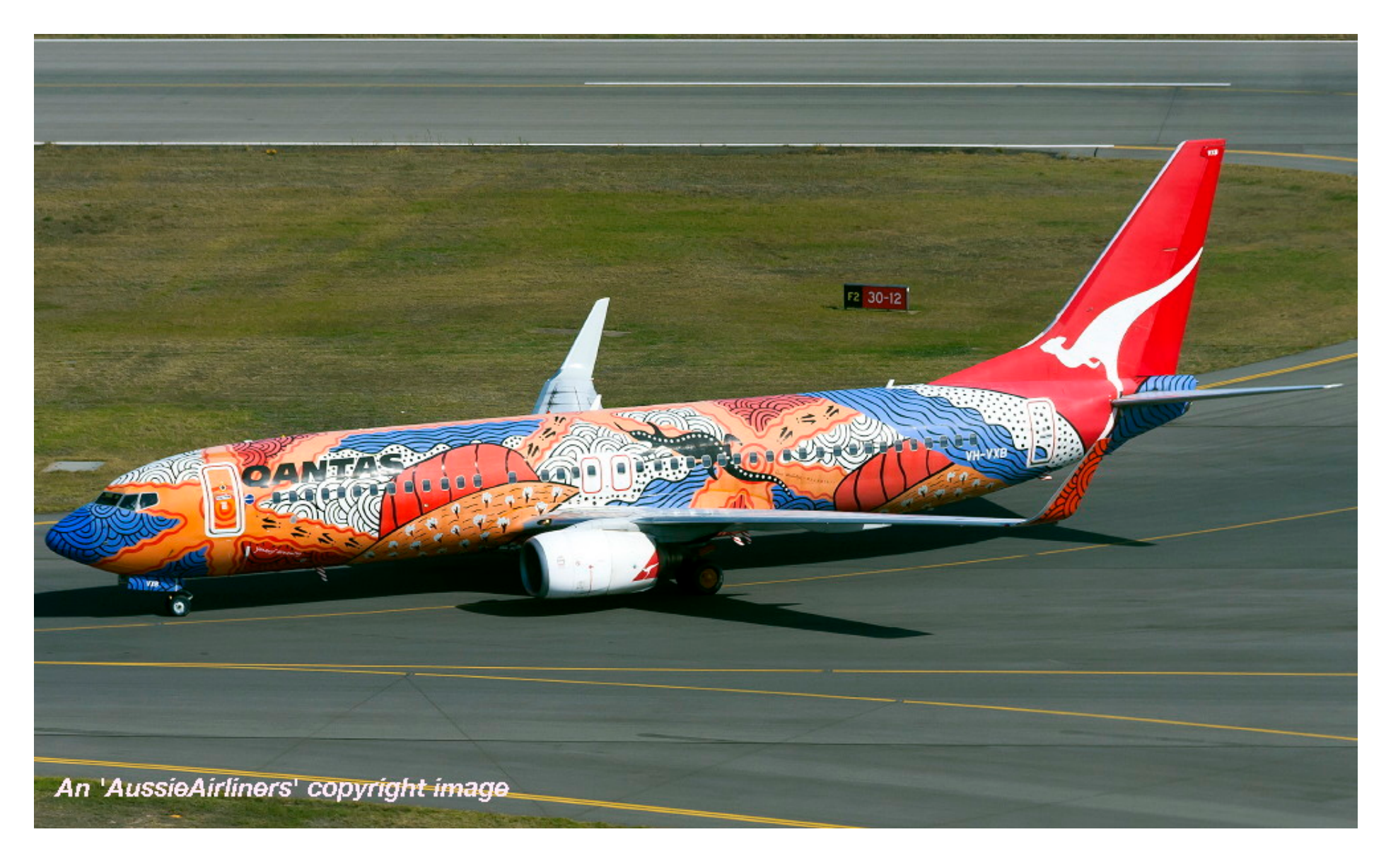
VH-VXB 'Yananyi Dreaming' in the aboriginal livery at Adelaide West Beach Airport, April 20, 2014.