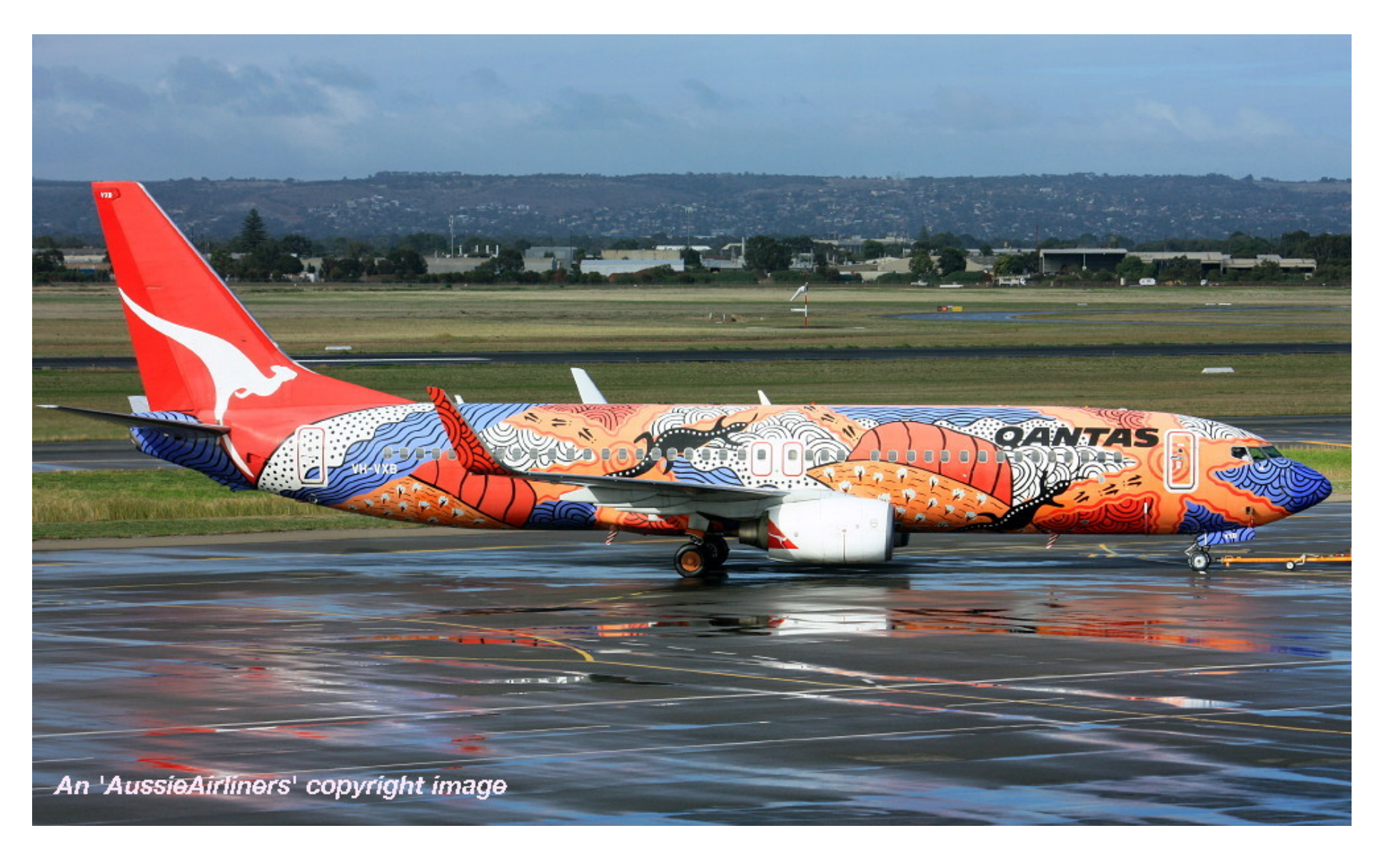
VH-VXB 'Yananyi Dreaming' in the aboriginal livery at Adelaide West Beach Airport, May 12, 2013.