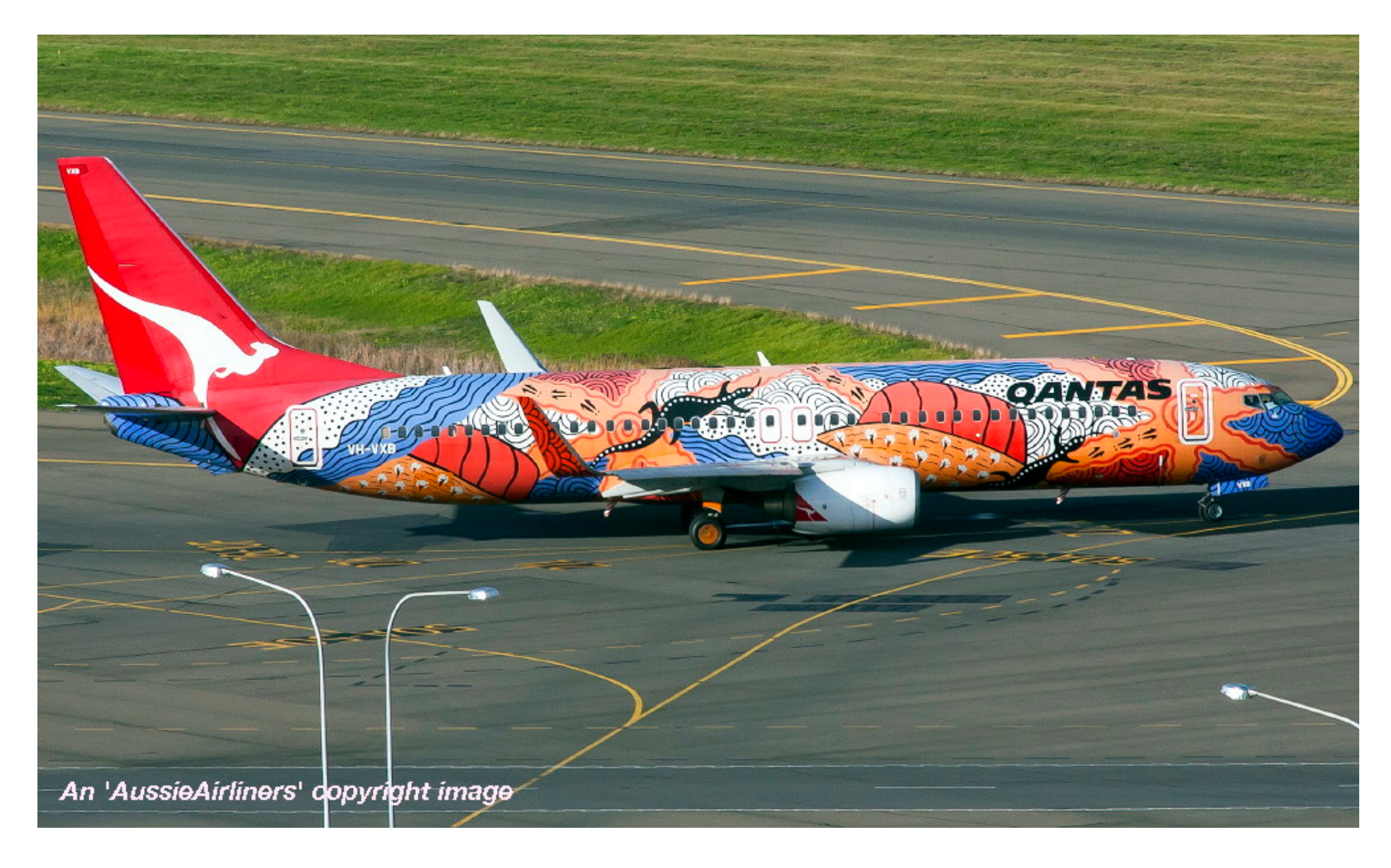
VH-VXB 'Yananyi Dreaming' in the aboriginal livery at Adelaide West Beach Airport, July 14, 2013.