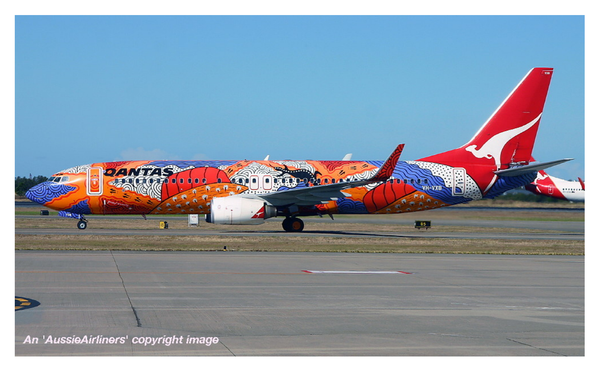
VH-VXB 'Yananyi Dreaming' in the aboriginal livery at Brisbane Airport, June 2006.