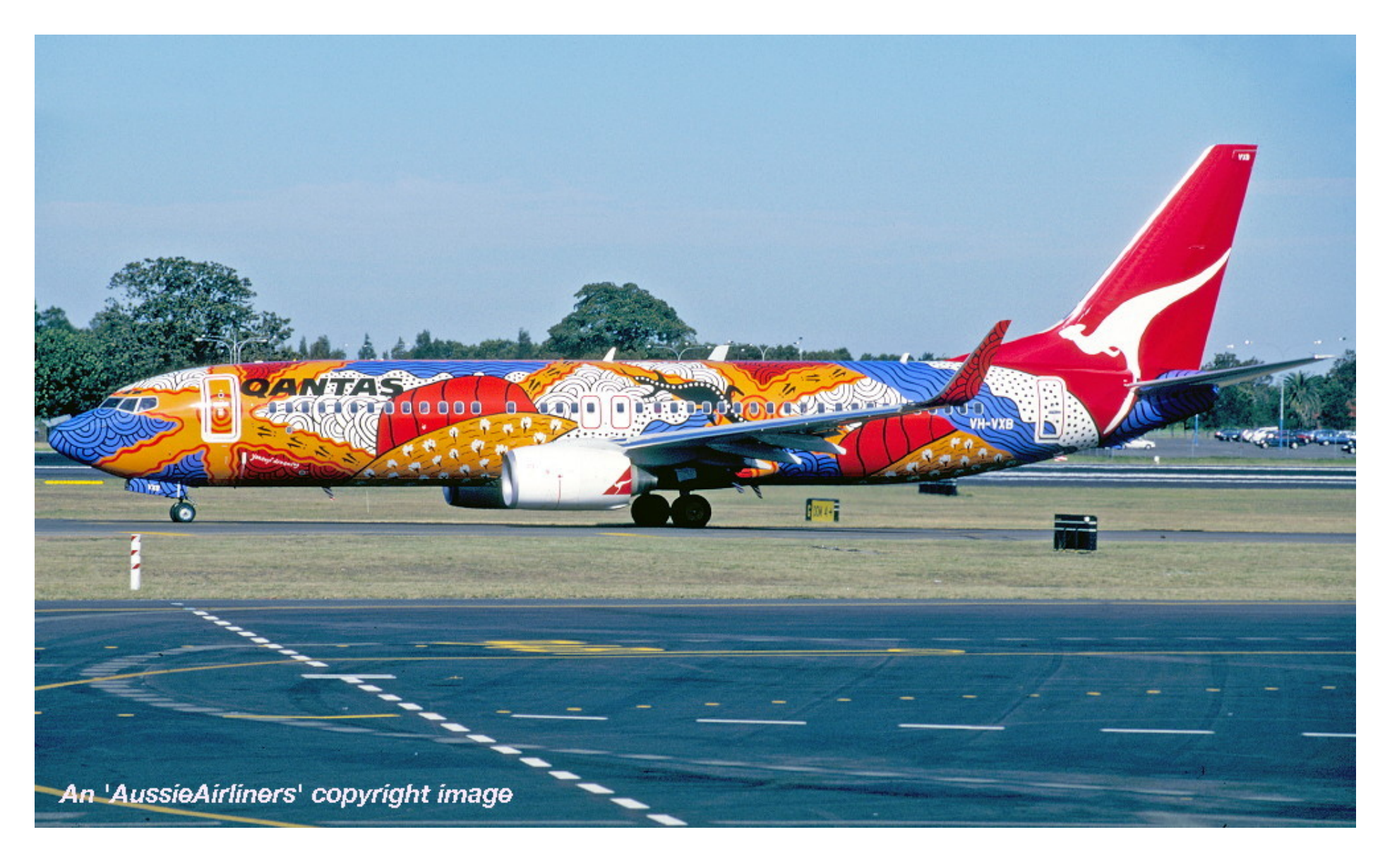
VH-VXB 'Yananyi Dreaming' in the aboriginal livery at Sydney Kingsford Smith Airport, July 2002.