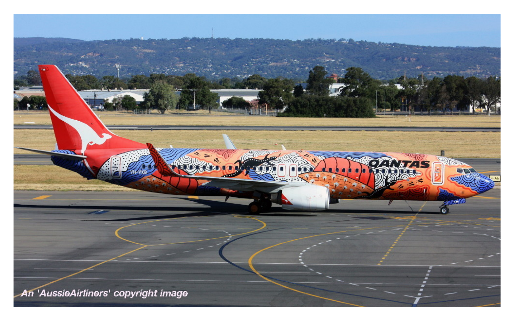
VH-VXB 'Yananyi Dreaming' in the aboriginal livery at Adelaide West Beach Airport, December 29, 2013.