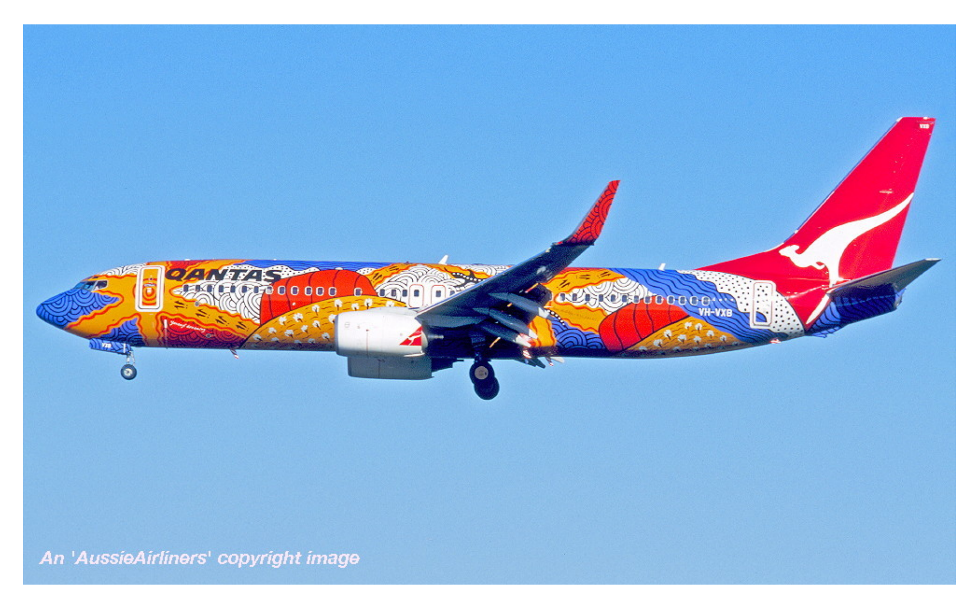
VH-VXB 'Yananyi Dreaming' in the aboriginal livery at Sydney Kingsford Smith Airport, June 2003.