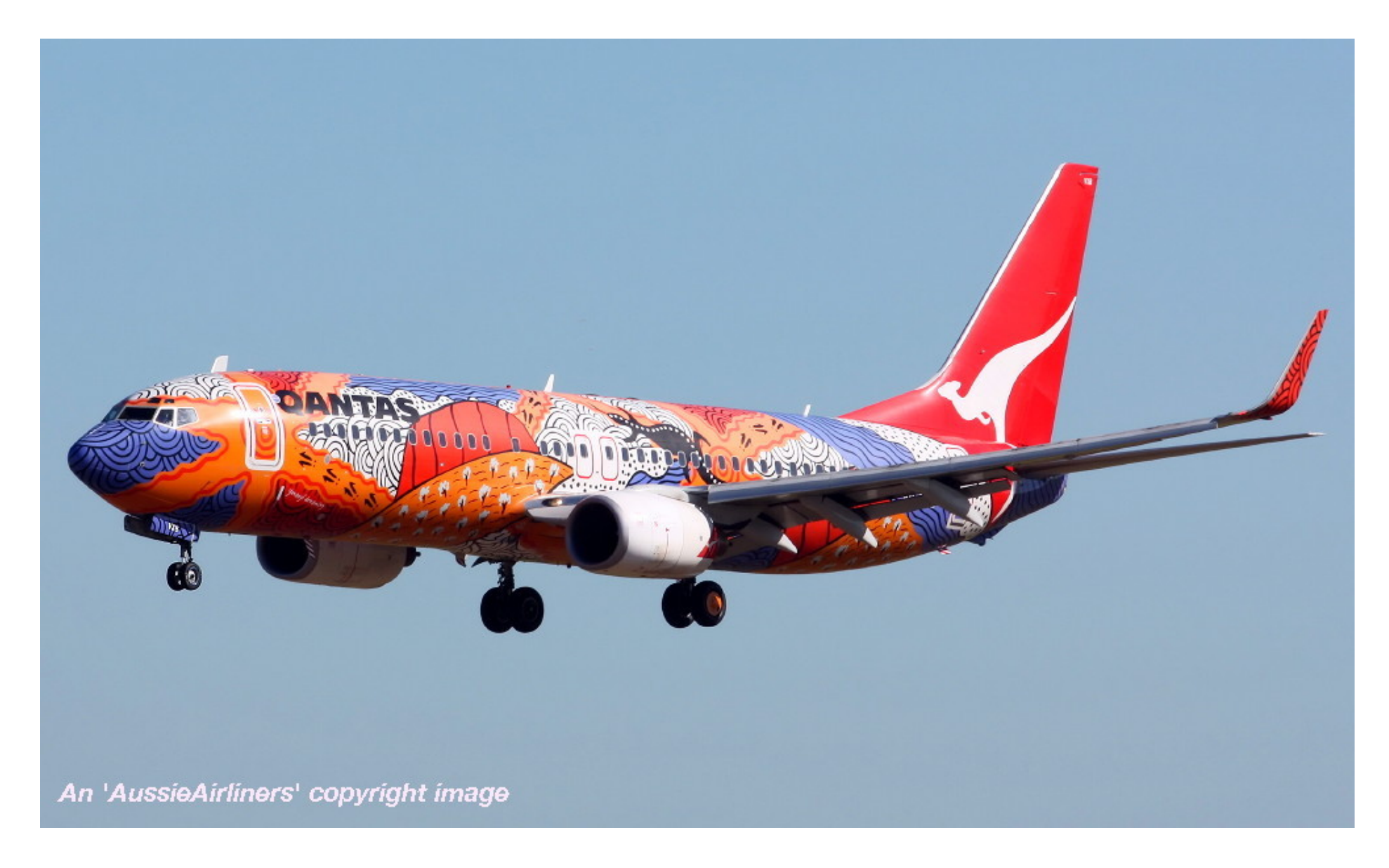
VH-VXB 'Yananyi Dreaming' in the aboriginal livery at Brisbane Airport, October 2008.