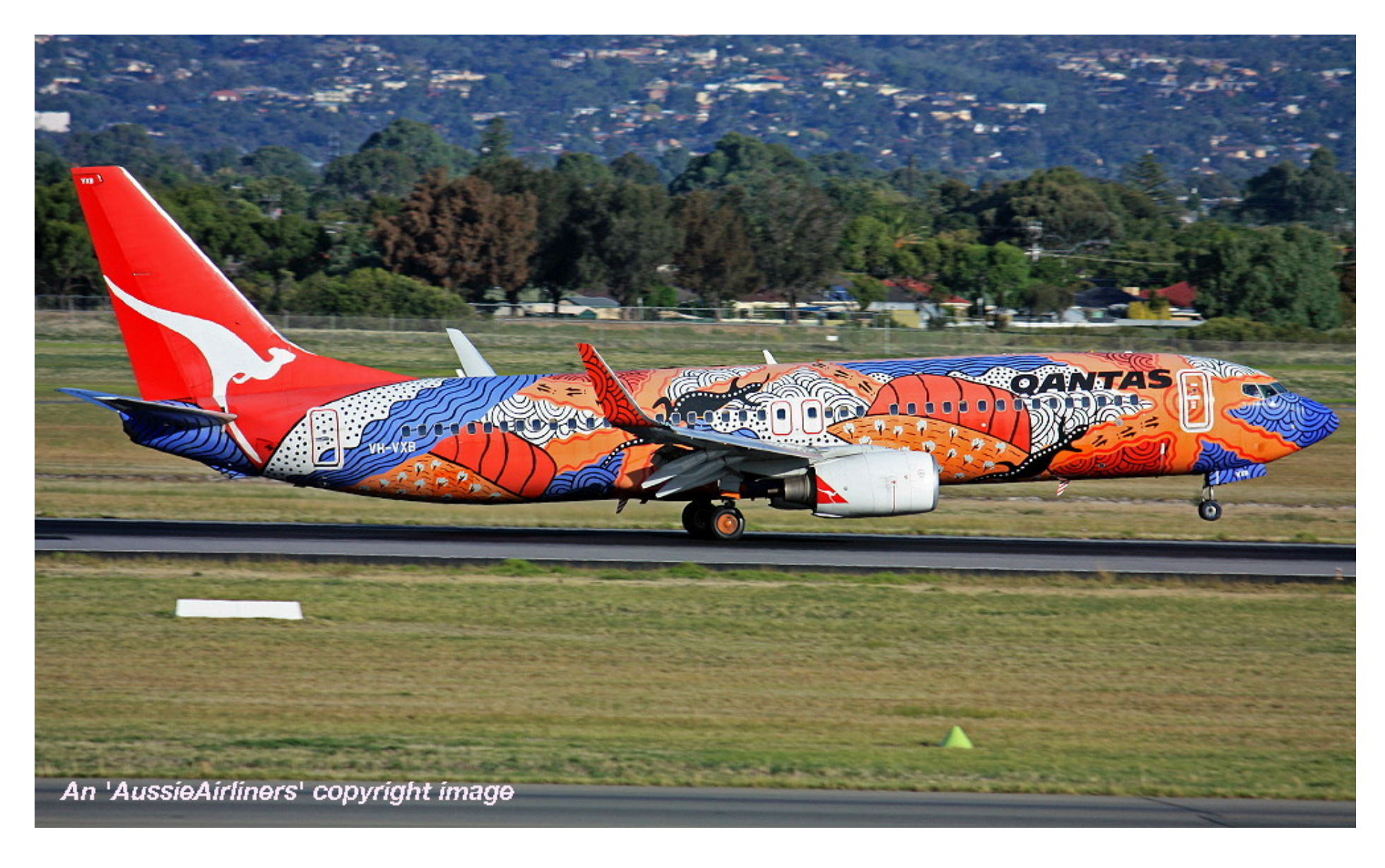
VH-VXB 'Yananyi Dreaming' in the aboriginal livery at Adelaide West Beach Airport, March 22, 2014.