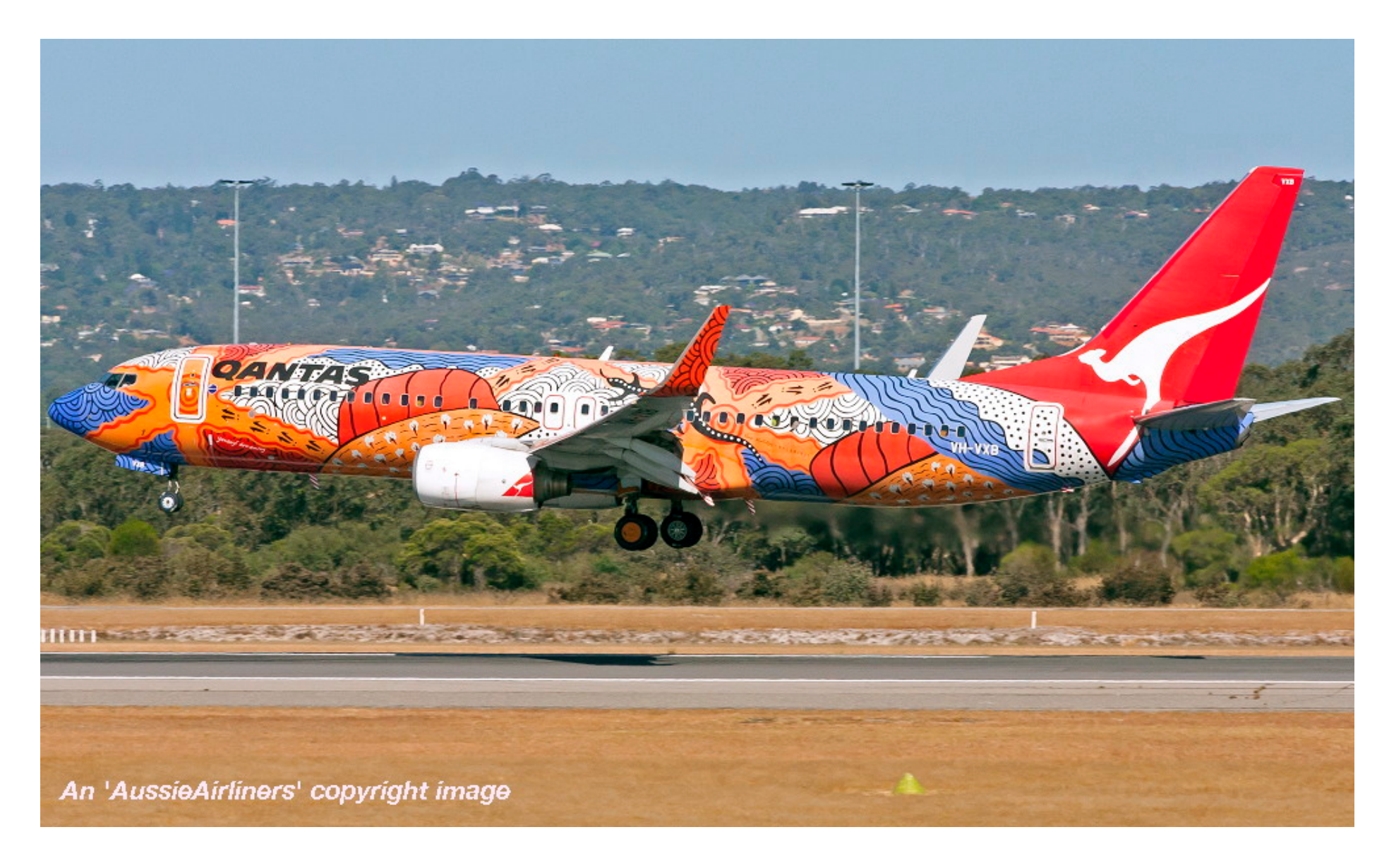
VH-VXB 'Yananyi Dreaming' in the aboriginal livery at Perth Airport, November 19, 2013.