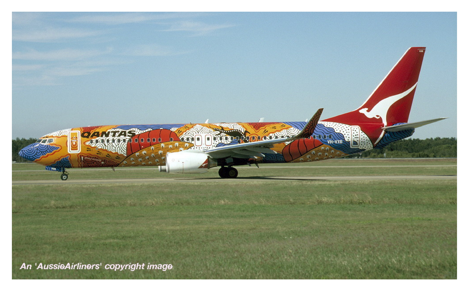
VH-VXB 'Yananyi Dreaming' in the aboriginal livery at Brisbane Airport, June 2003.