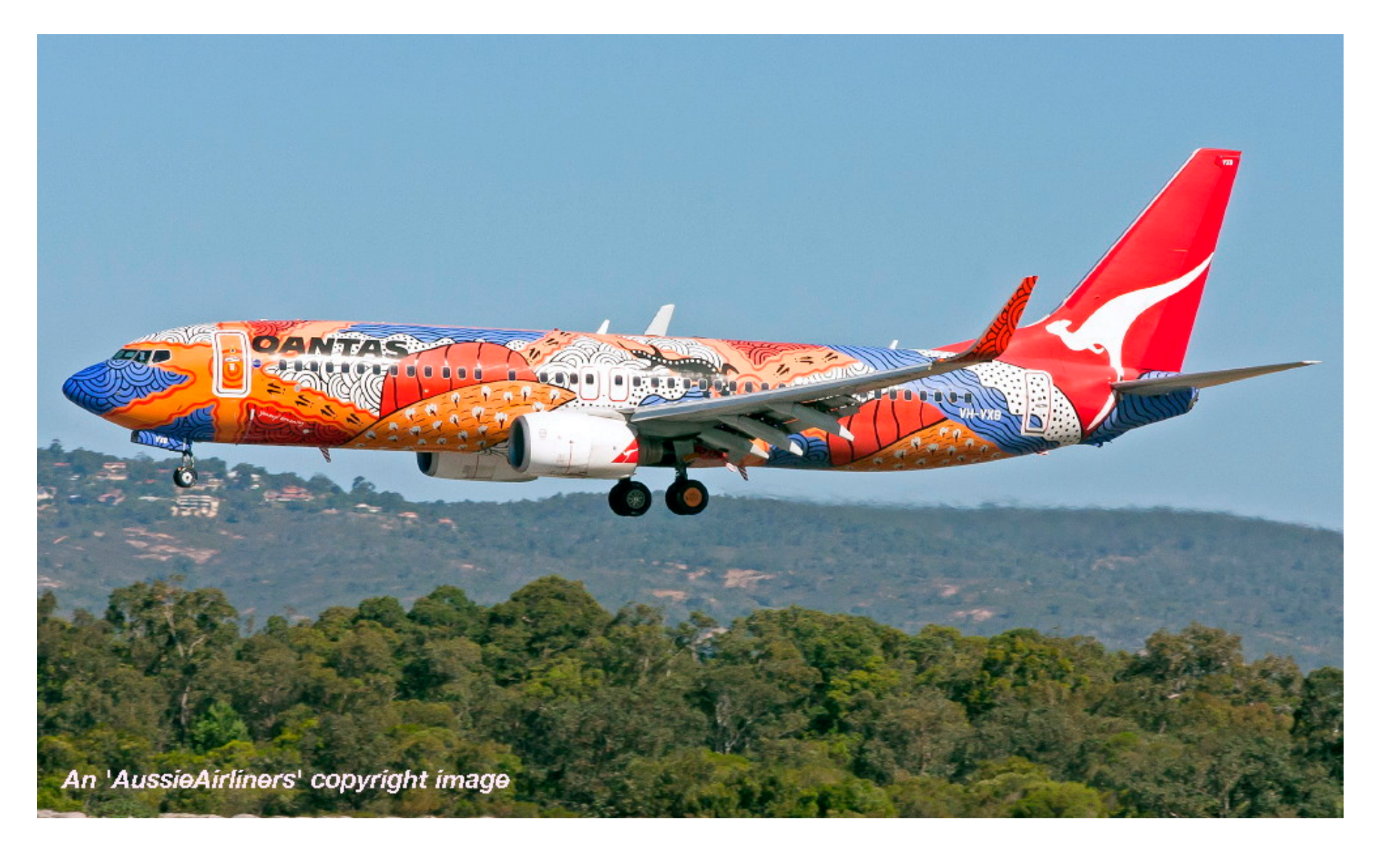
VH-VXB 'Yananyi Dreaming' in the aboriginal livery at Perth Airport, November 19, 2013.