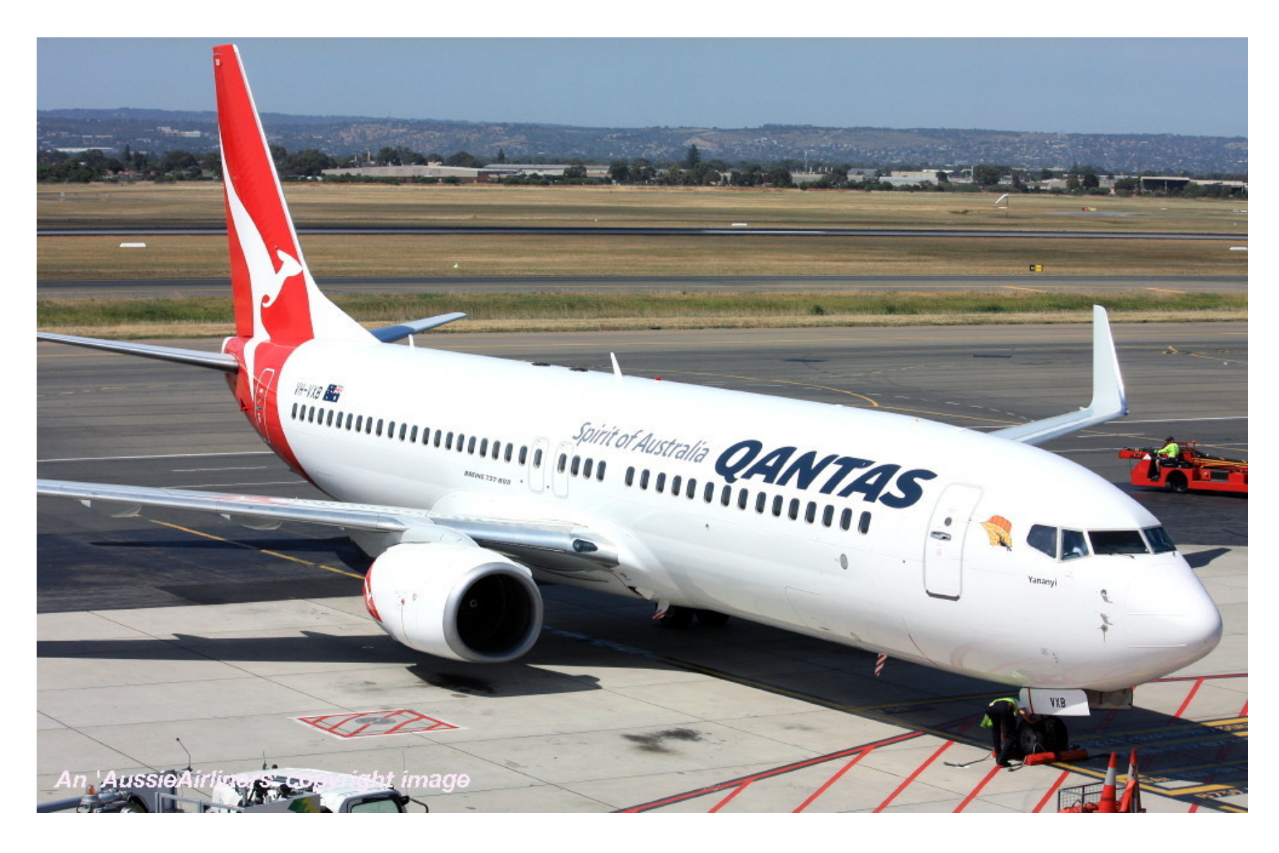
VH-VXB 'Yananyi' in the 'New Roo' livery at Adelaide West Beach Airport, October 22, 2014.