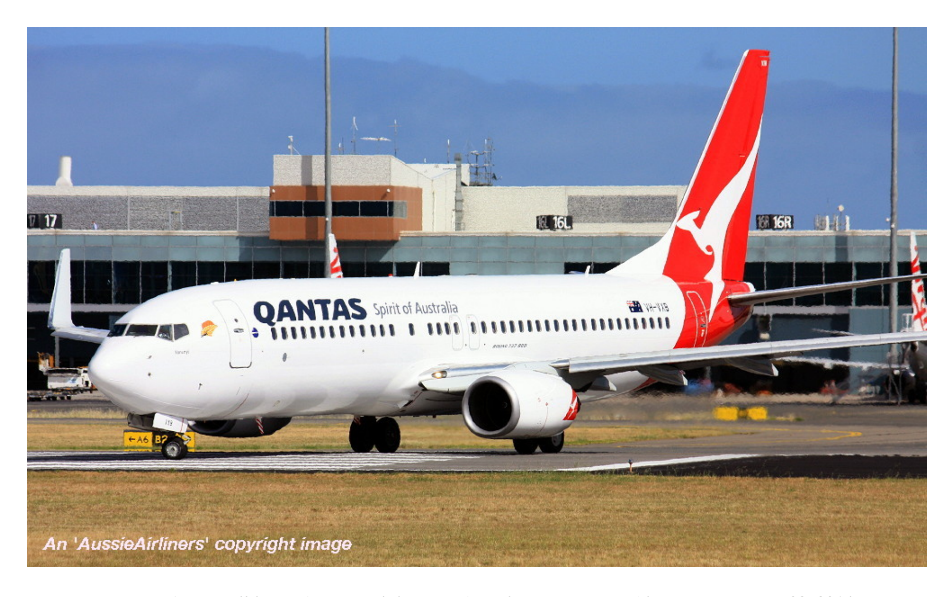
VH-VXB 'Yananyi' in the 'New Roo' livery at Adelaide West Beach Airport, November 09, 2014.