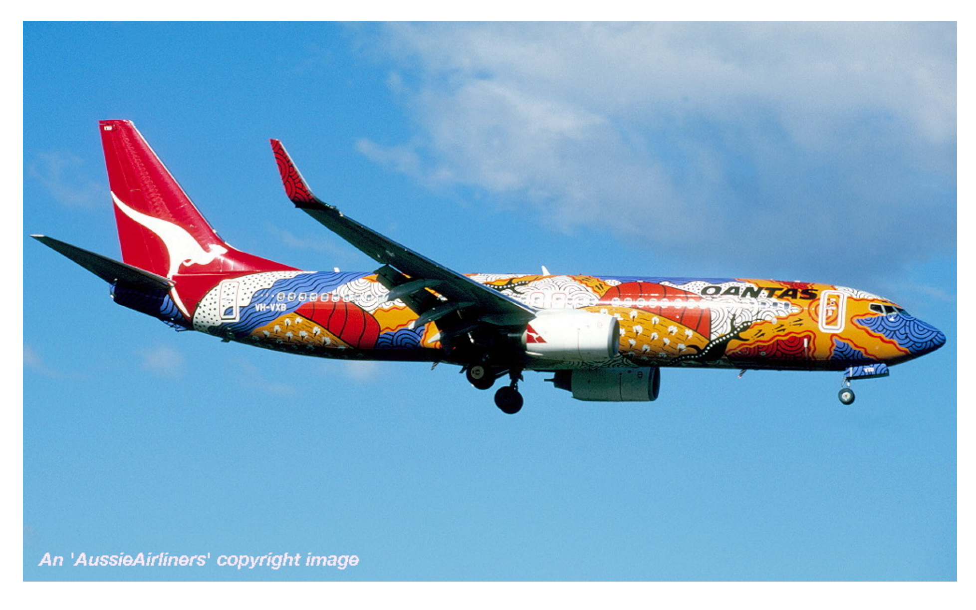
VH-VXB 'Yananyi Dreaming' in the aboriginal livery at Sydney Kingsford Smith Airport, July 2002.