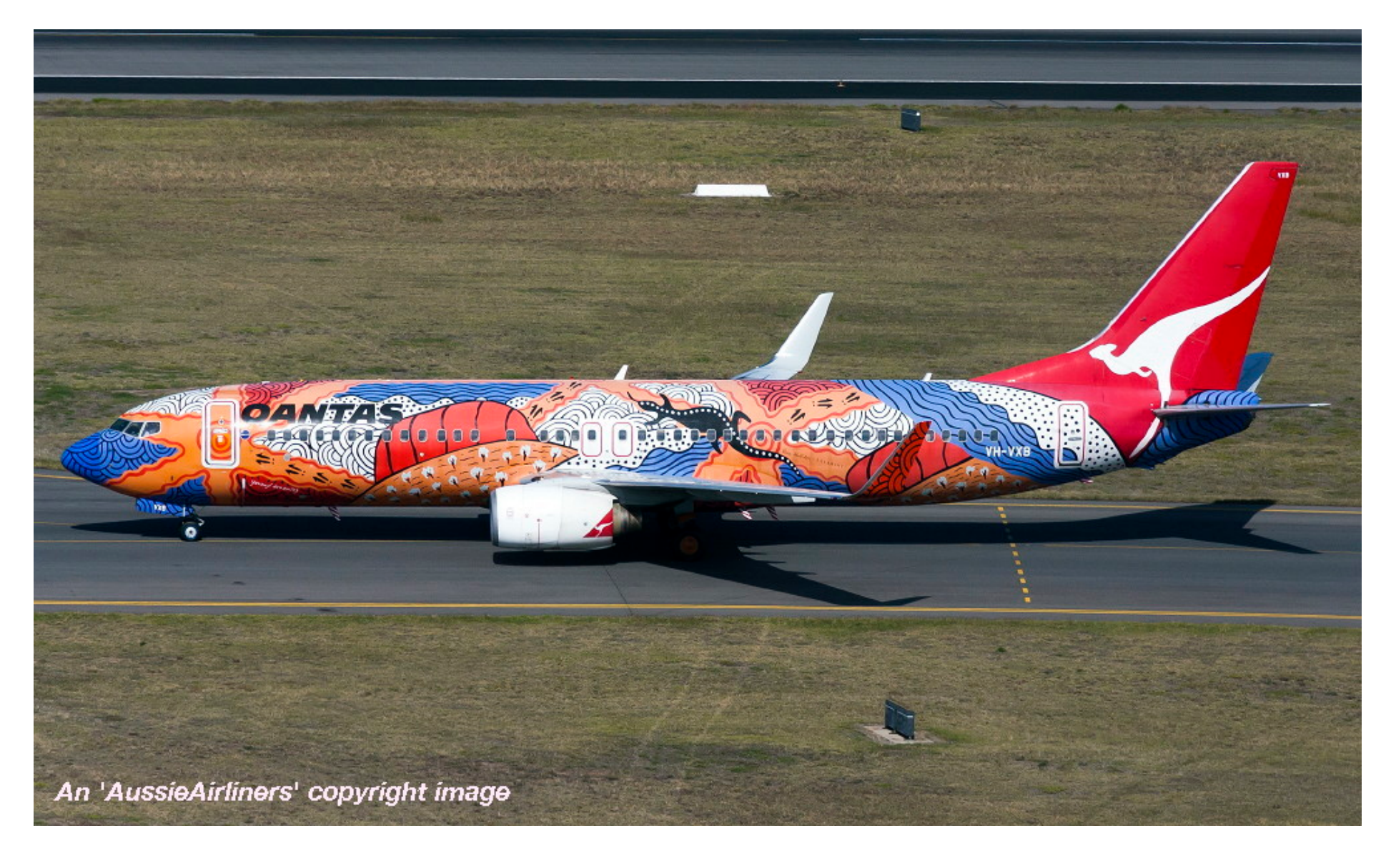
VH-VXB 'Yananyi Dreaming' in the aboriginal livery at Adelaide West Beach Airport, April 20, 2014.