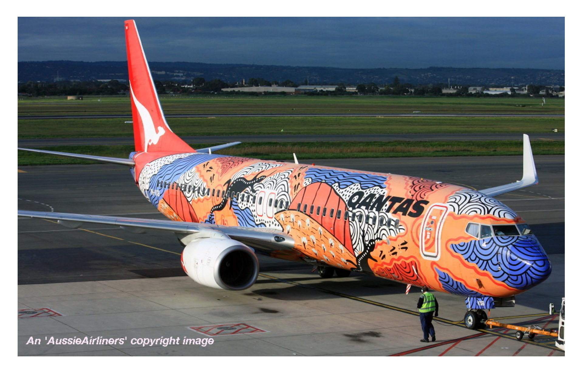
VH-VXB 'Yananyi Dreaming' in the aboriginal livery at Adelaide West Beach Airport, July 02, 2014.