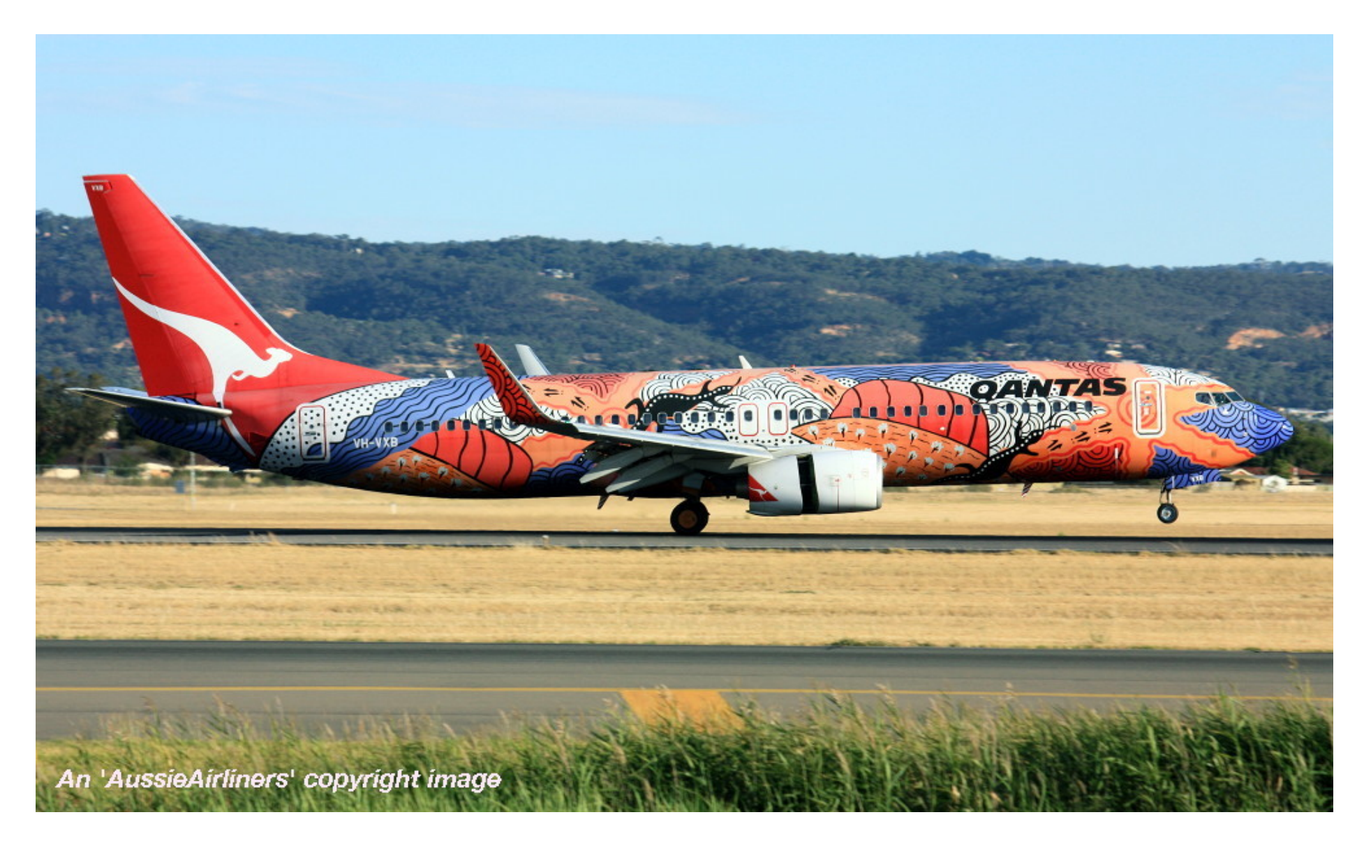
VH-VXB 'Yananyi Dreaming' in the aboriginal livery at Adelaide West Beach Airport, December 25, 2013.