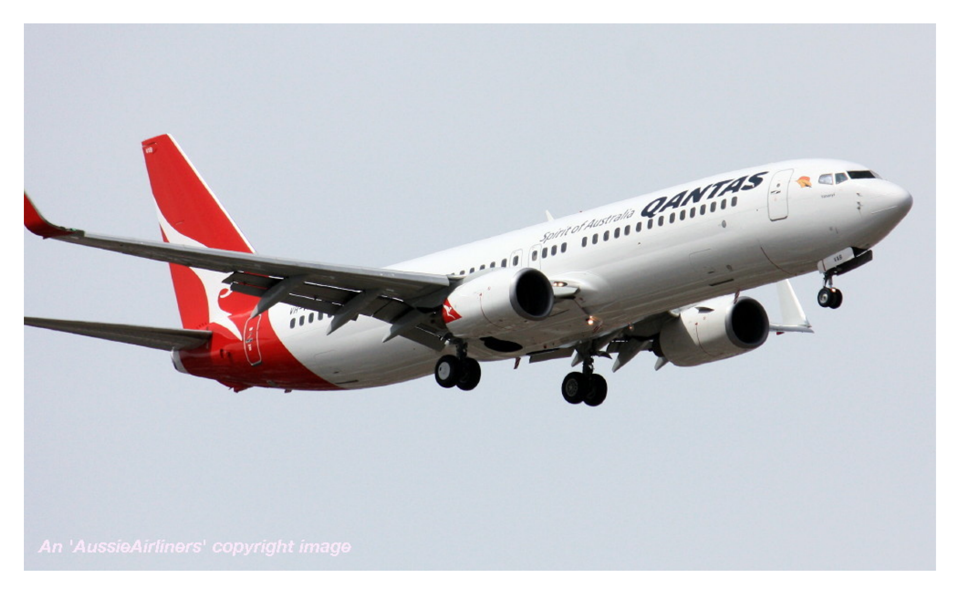
VH-VXB 'Yananyi' in the 'New Roo' livery at Adelaide West Beach Airport, September 24, 2014.