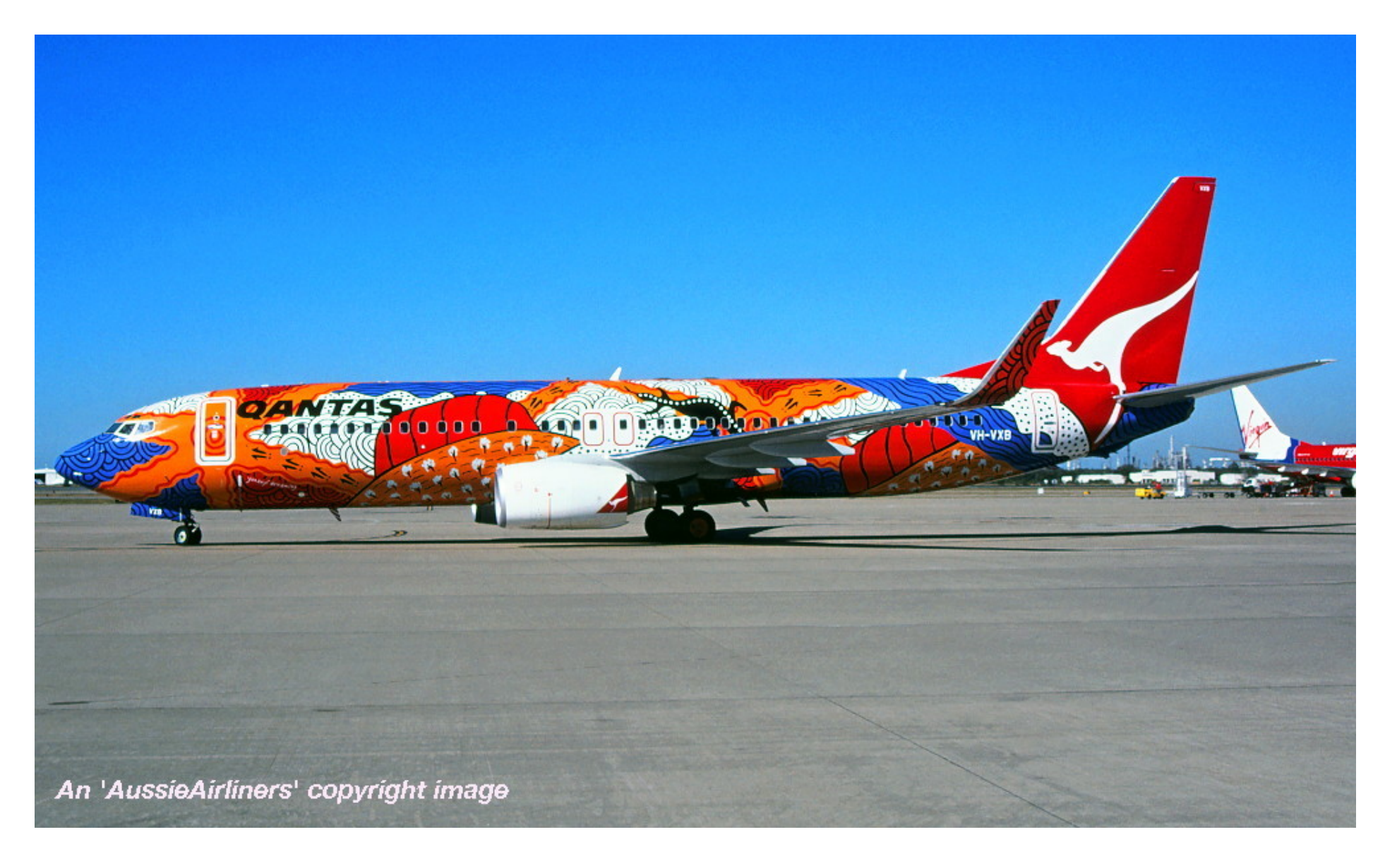
VH-VXB 'Yananyi Dreaming' in the aboriginal livery at Brisbane Airport, August 2002.