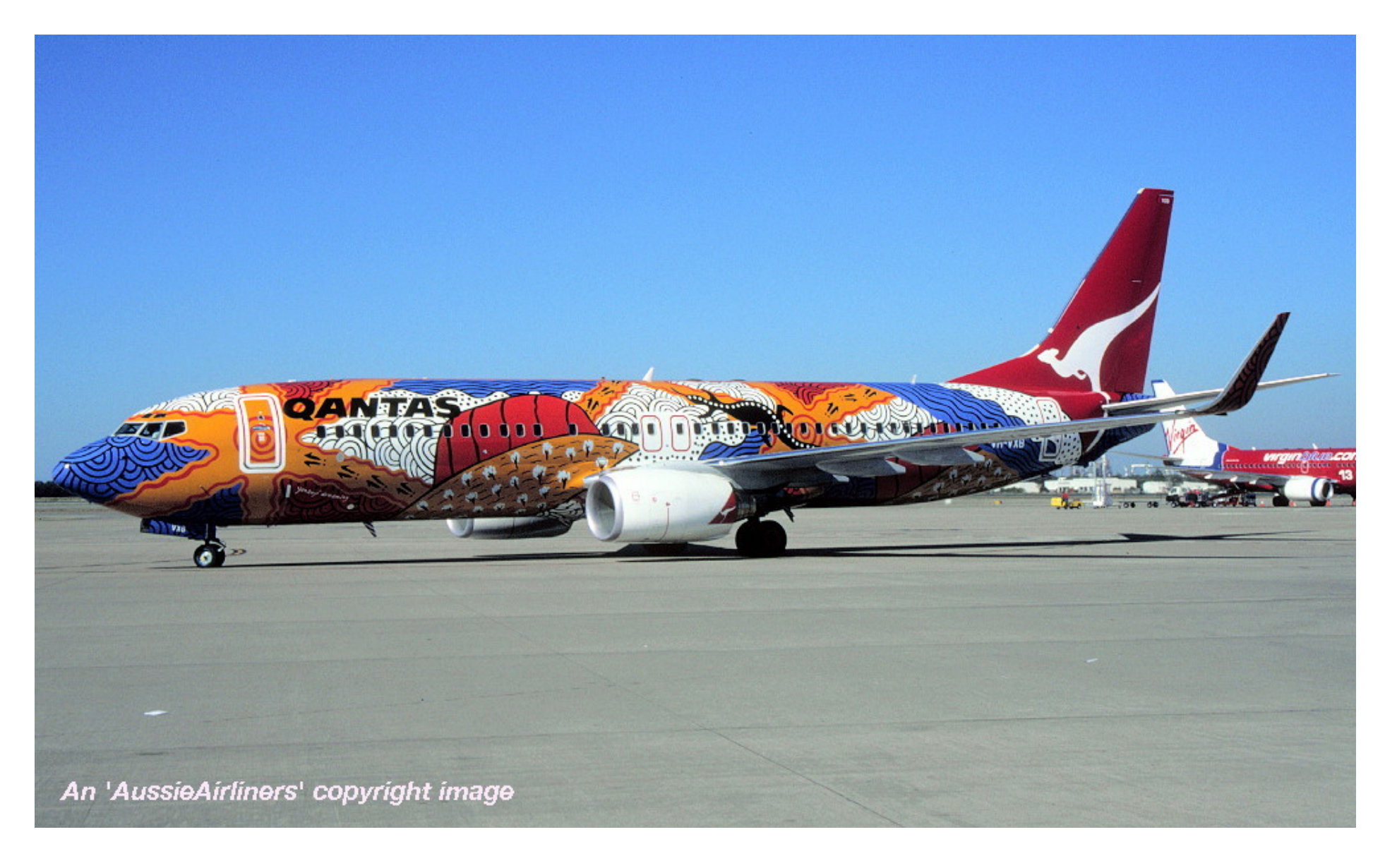
VH-VXB 'Yananyi Dreaming' in the aboriginal at Brisbane Airport, April 2002.