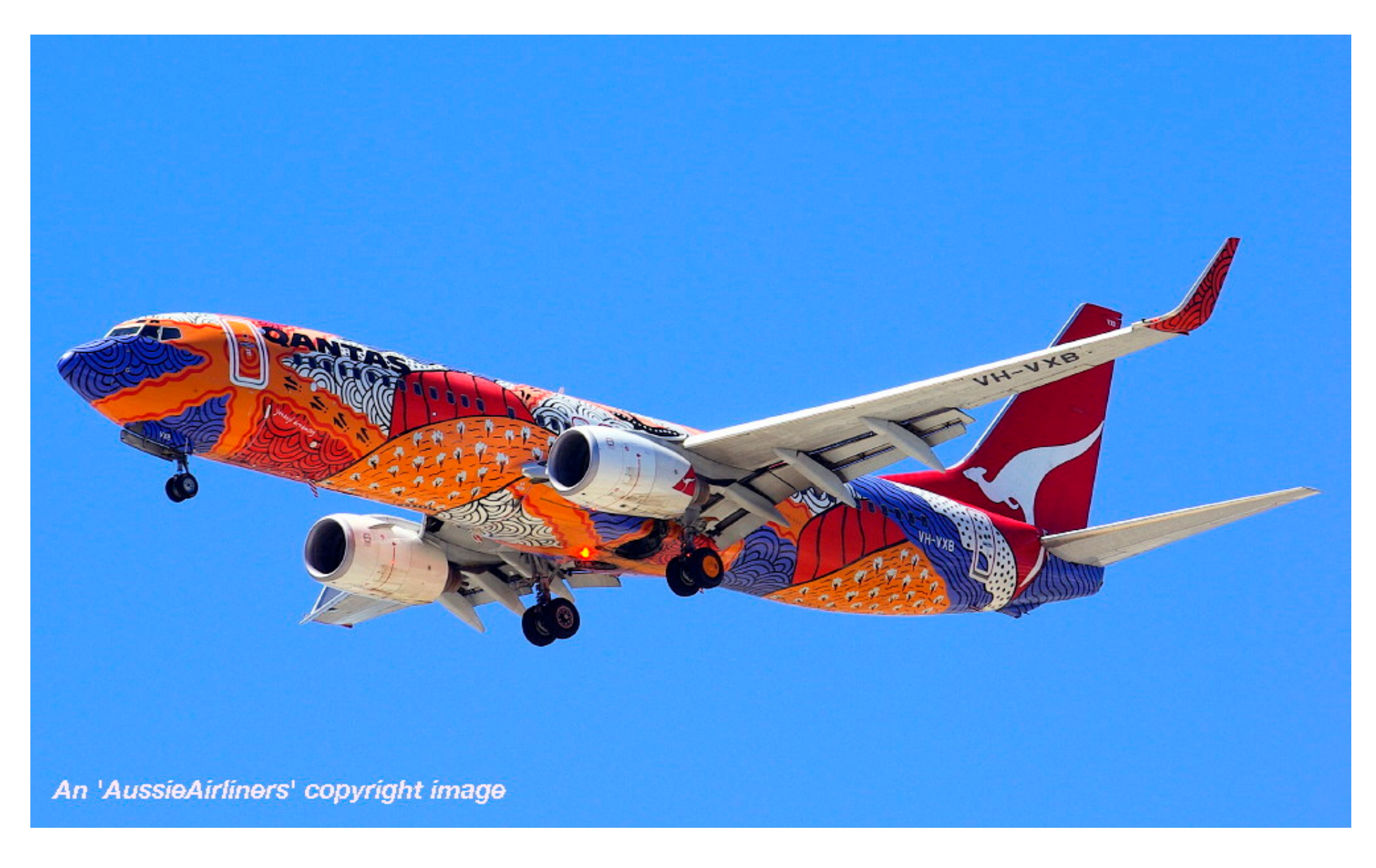
VH-VXB 'Yananyi Dreaming' in the aboriginal livery at Perth Airport, November 19, 2008.