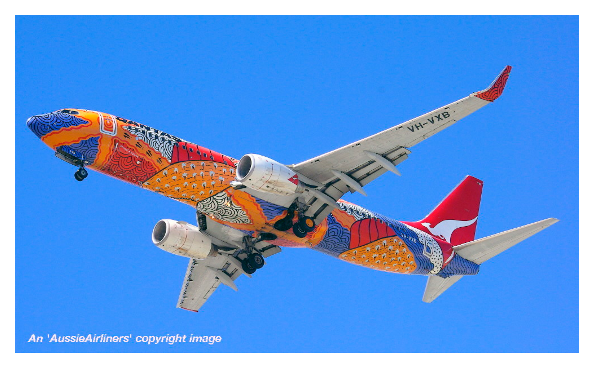
VH-VXB 'Yananyi Dreaming' in the aboriginal livery at Perth Airport, May 06, 2009.