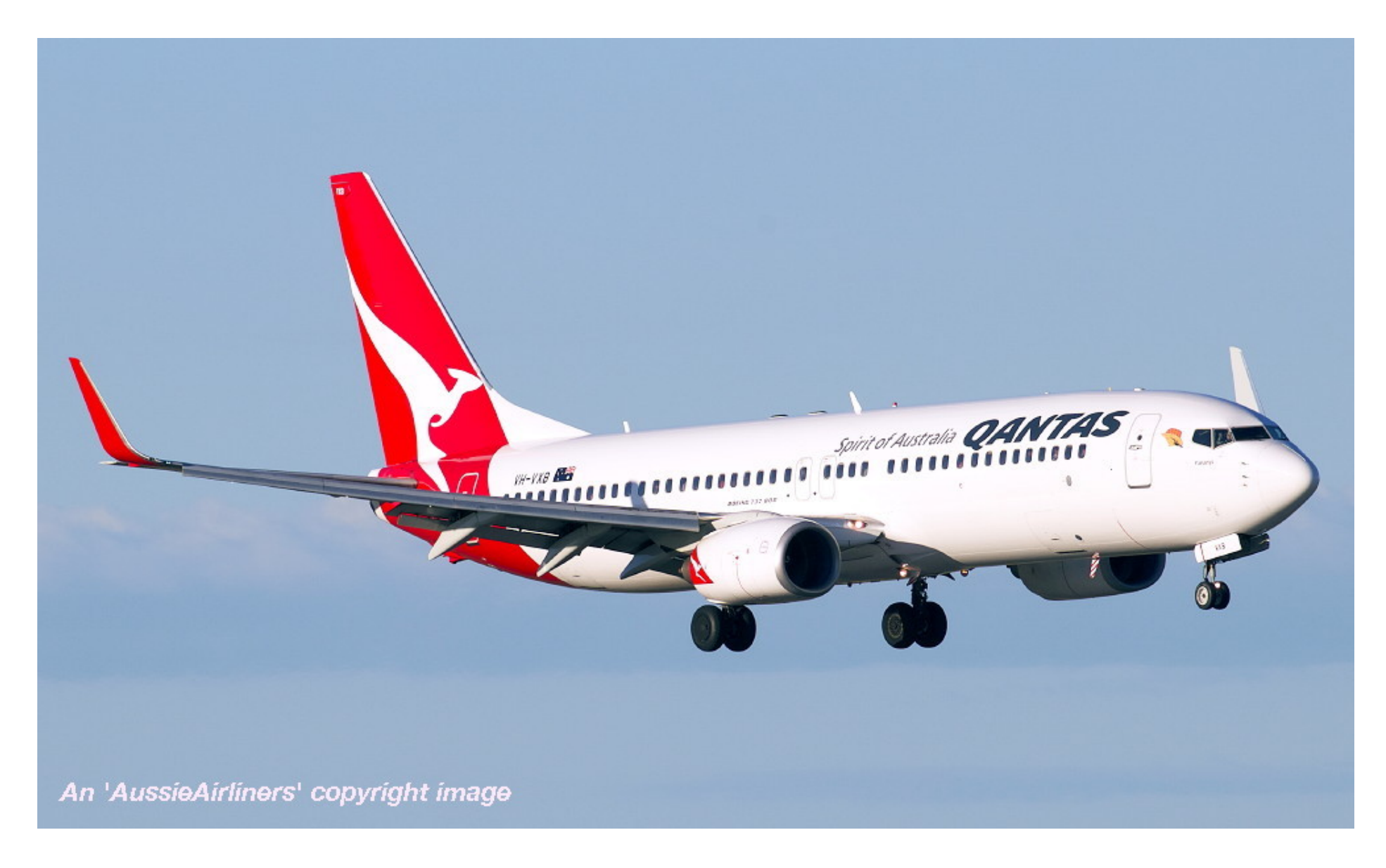
VH-VXB 'Yananyi' in the 'New Roo' livery at Adelaide West Beach Airport, June 10, 2016.