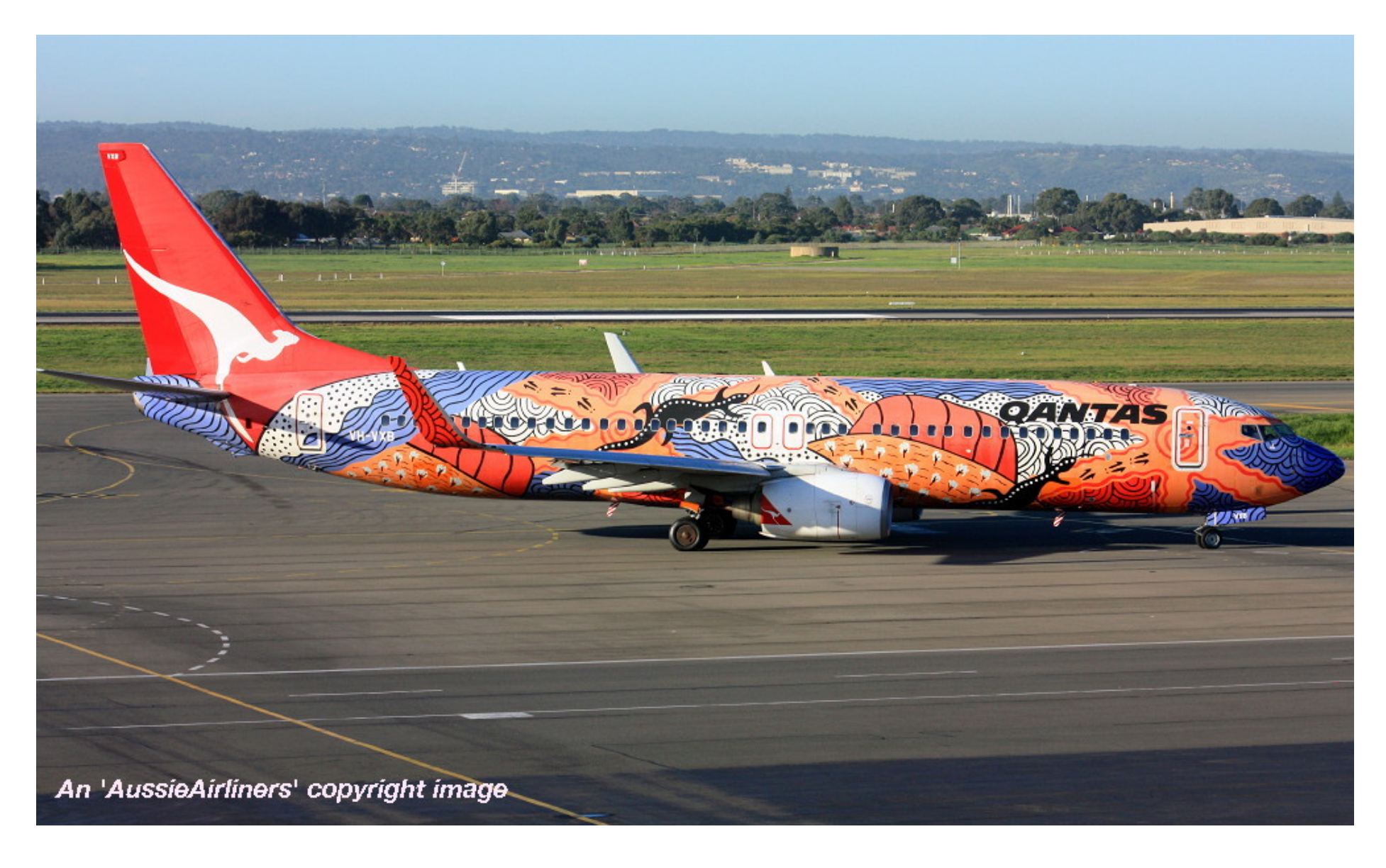
VH-VXB 'Yananyi Dreaming' in the aboriginal livery at Adelaide West Beach Airport, June 18, 2014.