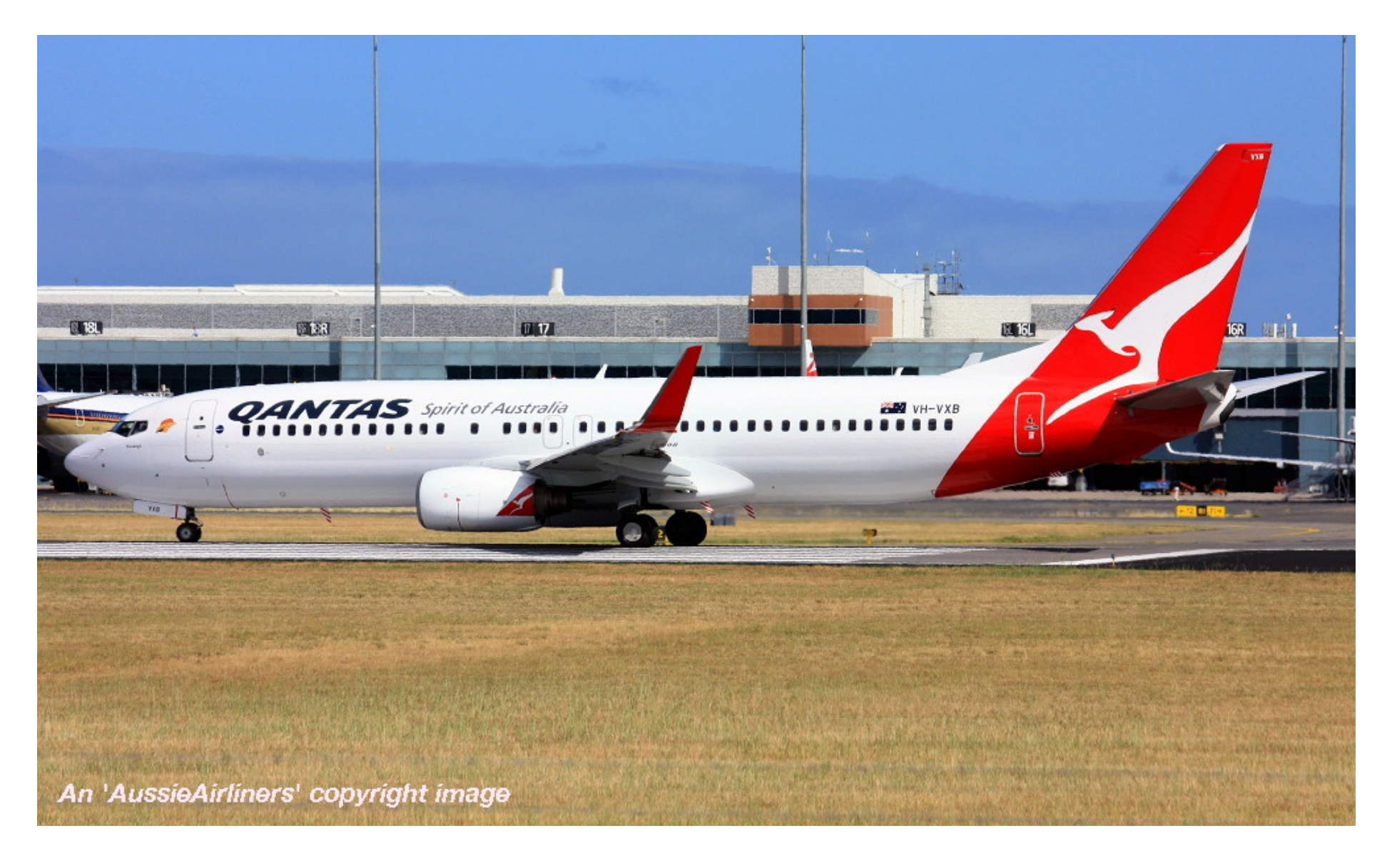
VH-VXB 'Yananyi' in the 'New Roo' livery at Adelaide West Beach Airport, November 09, 2014.