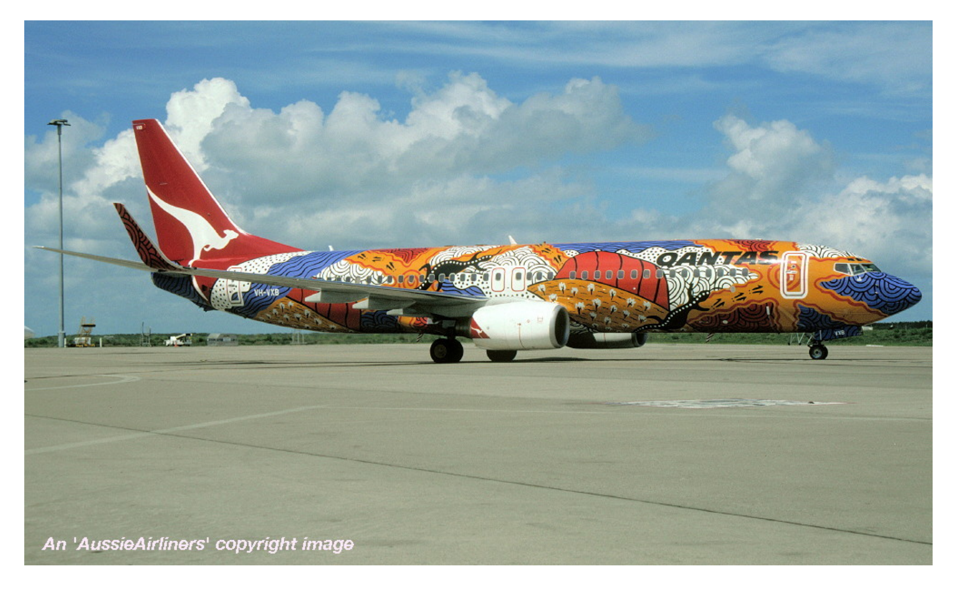
VH-VXB 'Yananyi Dreaming' in the aboriginal livery at Brisbane Airport, February 2002.