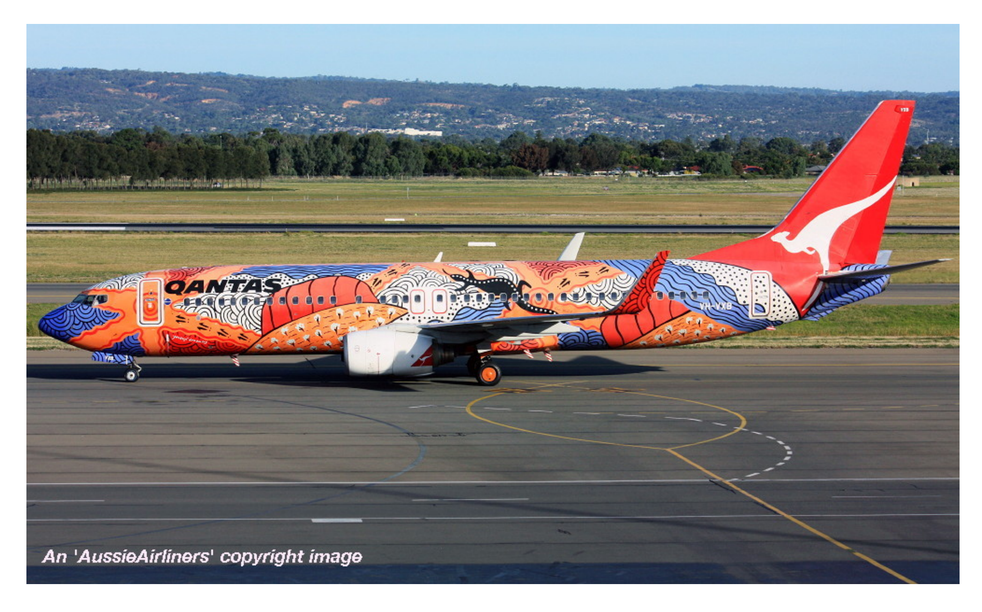
VH-VXB 'Yananyi Dreaming' in the aboriginal livery at Adelaide West Beach Airport, March 22, 2014.