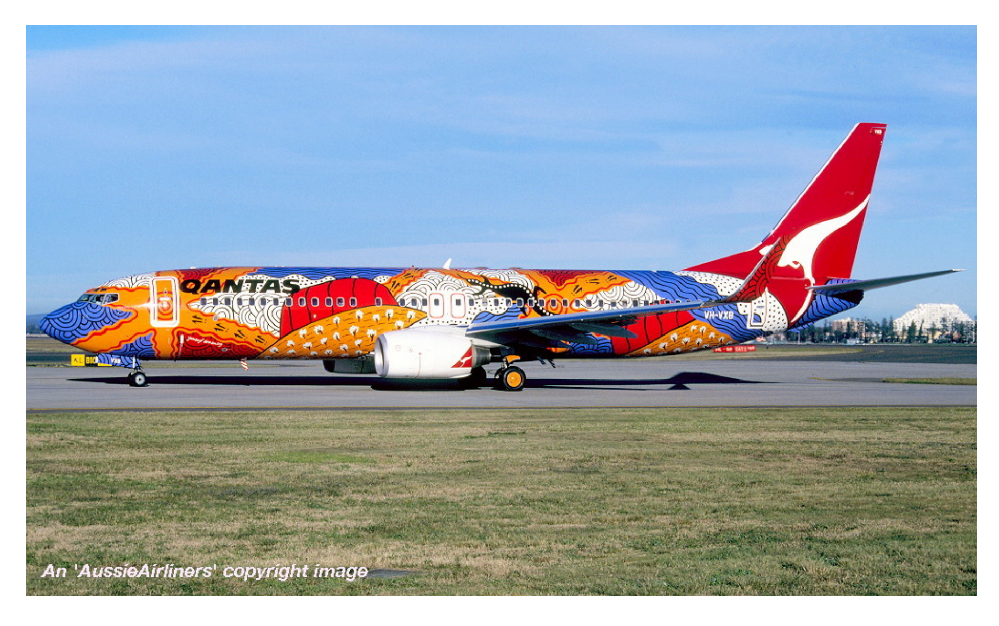
VH-VXB 'Yananyi Dreaming' in the aboriginal livery at Sydney Kingsford Smith Airport, October 2003.