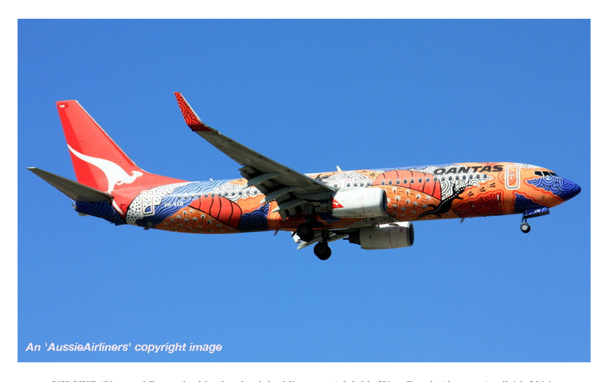
VH-VXB 'Yananyi Dreaming' in the aboriginal livery at Adelaide West Beach Airport, April 16, 2014.