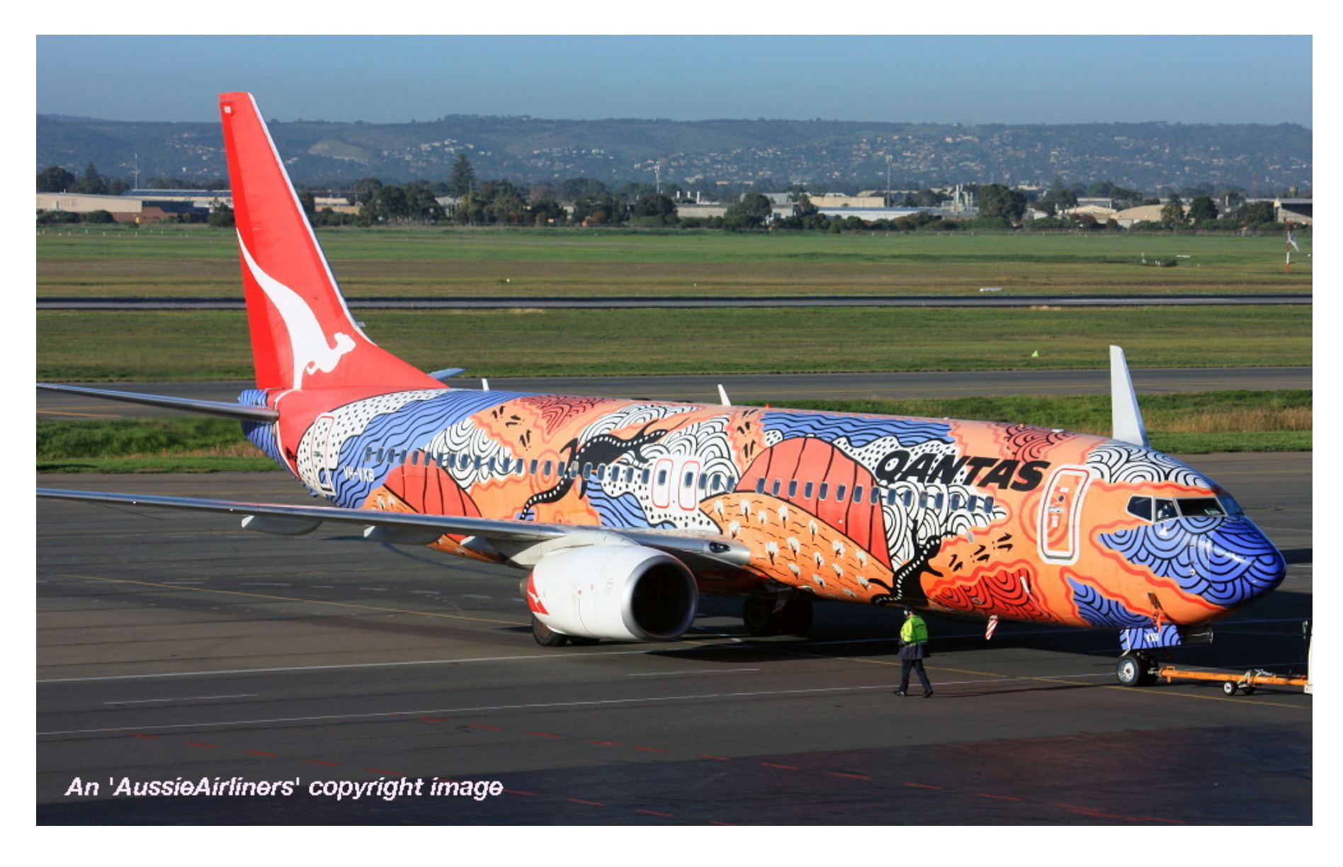
VH-VXB 'Yananyi Dreaming' in the aboriginal livery at Adelaide West Beach Airport, June 18, 2014.