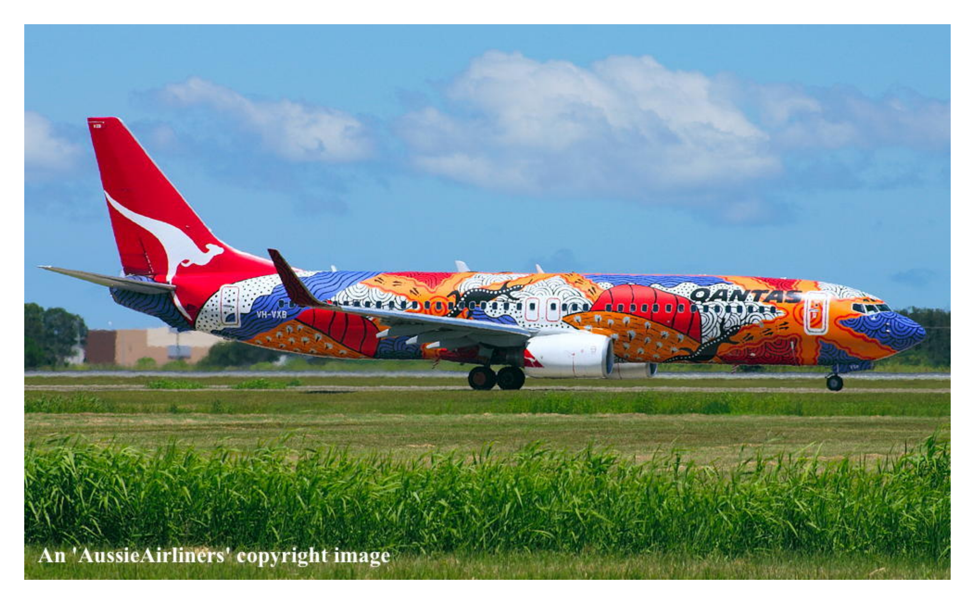
VH-VXB 'Yananyi Dreaming' in the aboriginal livery at Brisbane Airport, January 16, 2005.