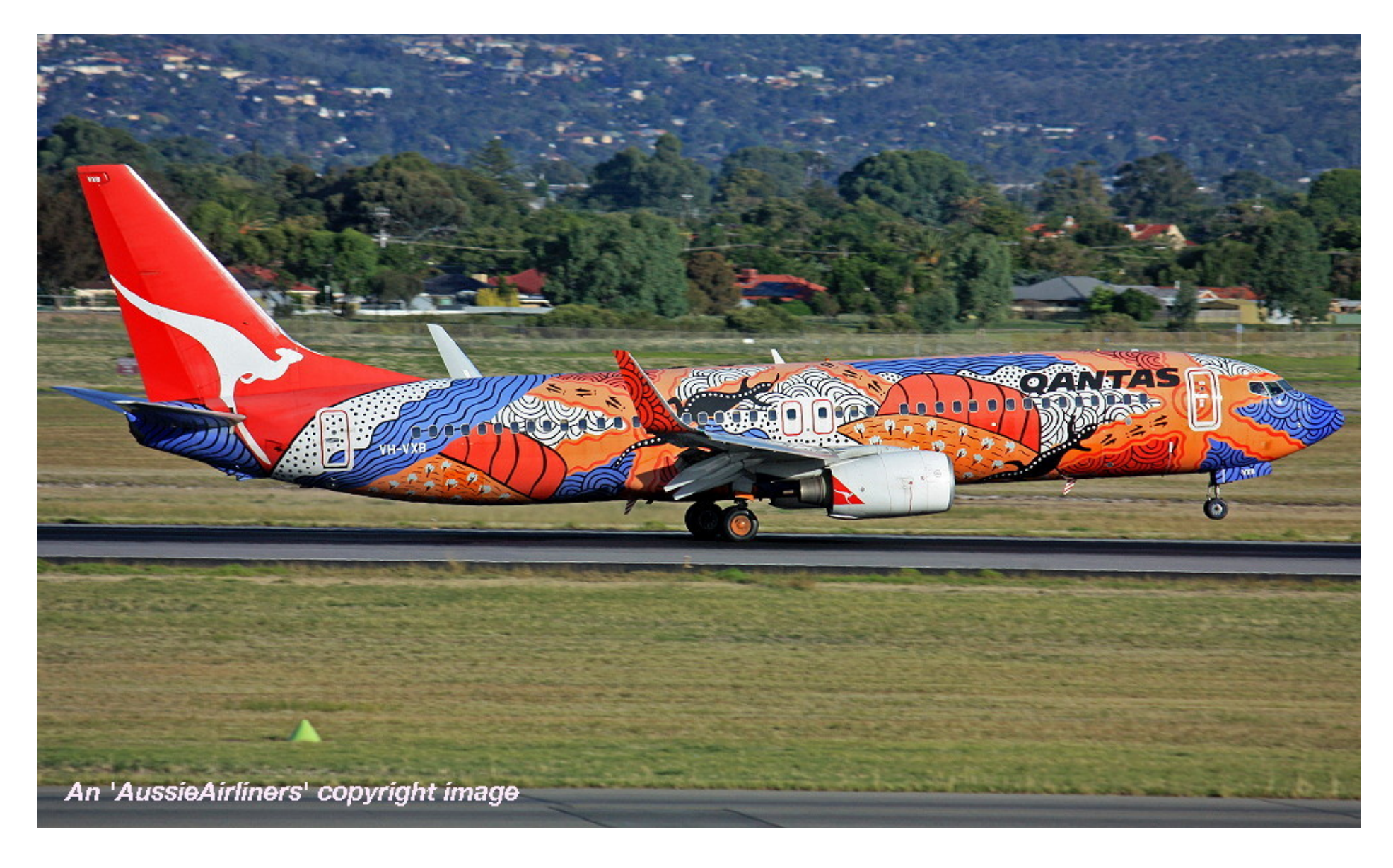
VH-VXB 'Yananyi Dreaming' in the aboriginal livery at Adelaide West Beach Airport, March 22, 2014.