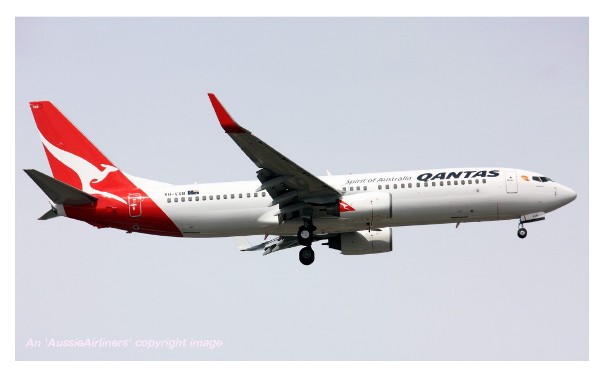
VH-VXB 'Yananyi' in the 'New Roo' livery at Adelaide West Beach Airport, September 24, 2014.