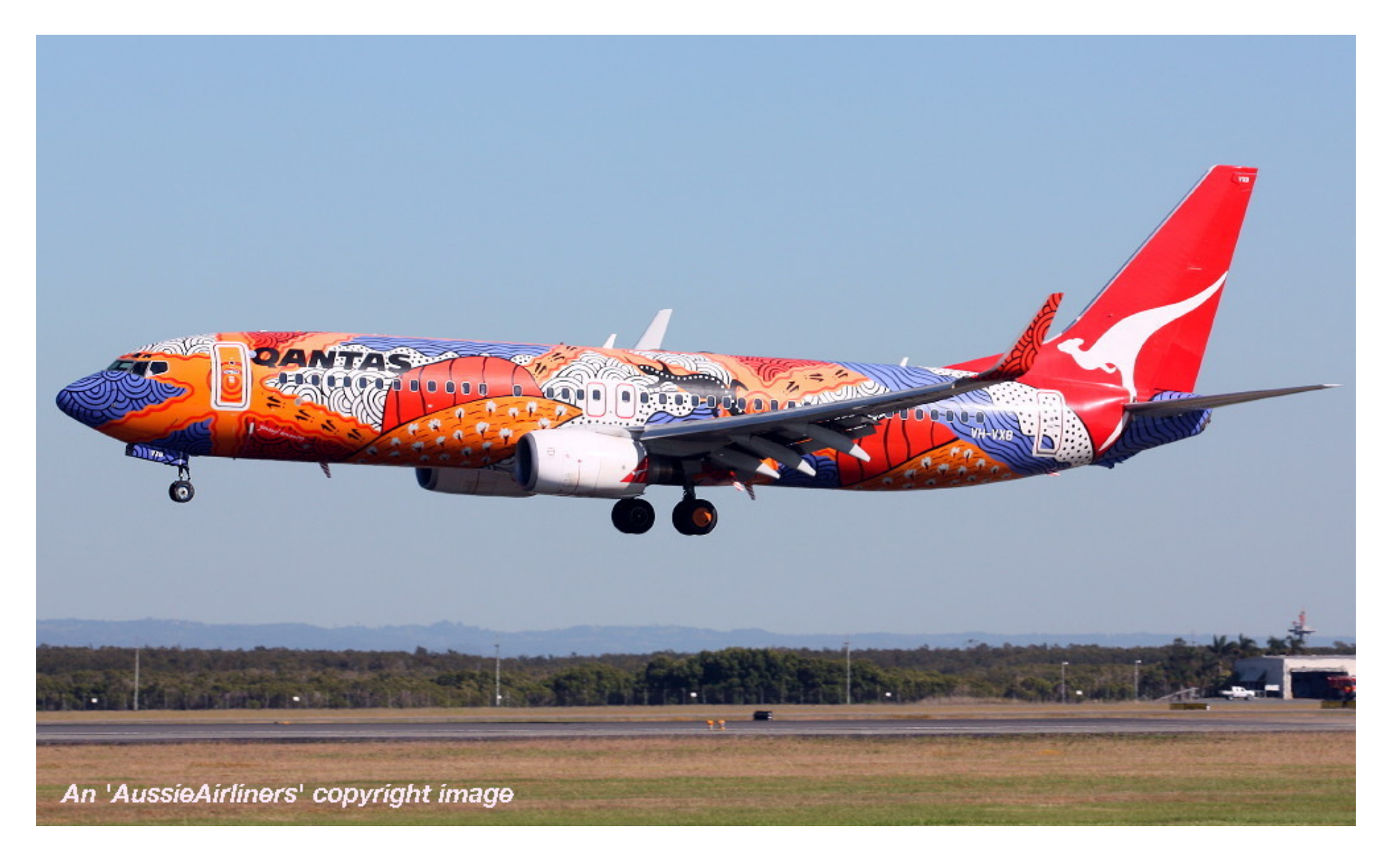
VH-VXB 'Yananyi Dreaming' in the aboriginal livery at Brisbane Airport, October 2008.