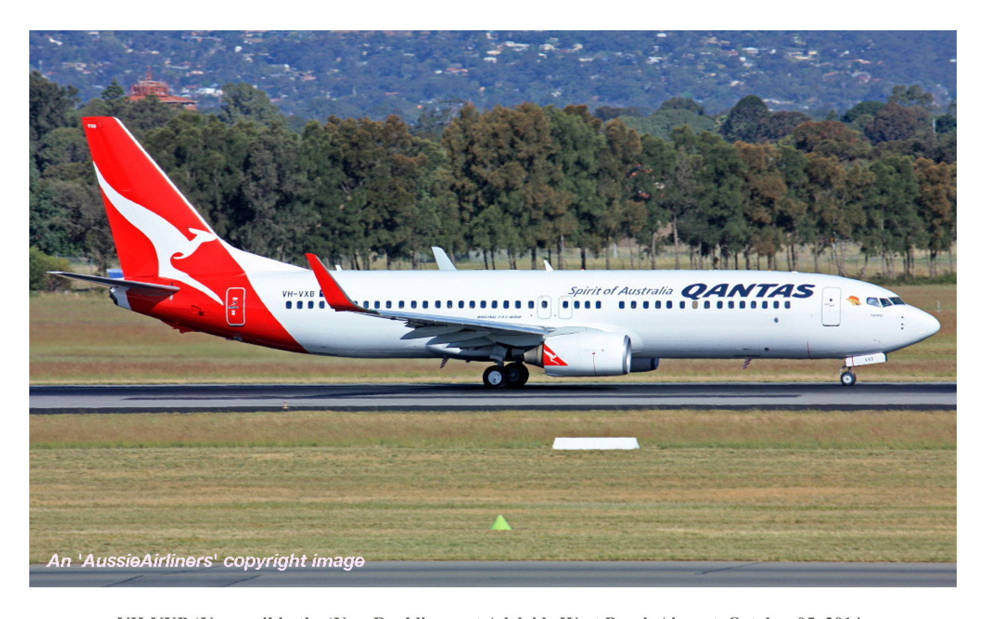
VH-VXB 'Yananyi' in the 'New Roo' livery at Adelaide West Beach Airport, October 05, 2014.