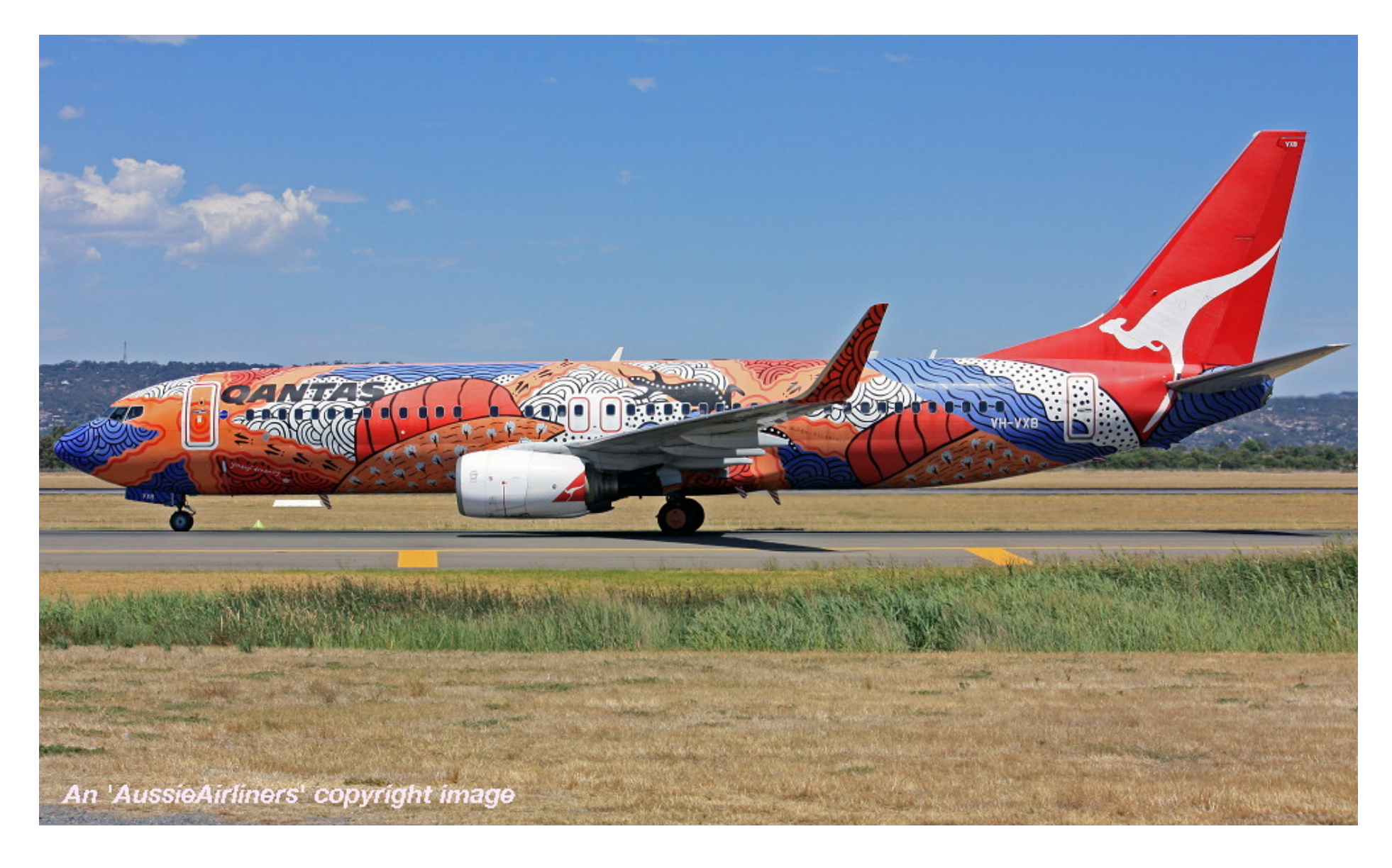
VH-VXB 'Yananyi Dreaming' in the aboriginal livery at Adelaide West Beach Airport, February 02, 2014.