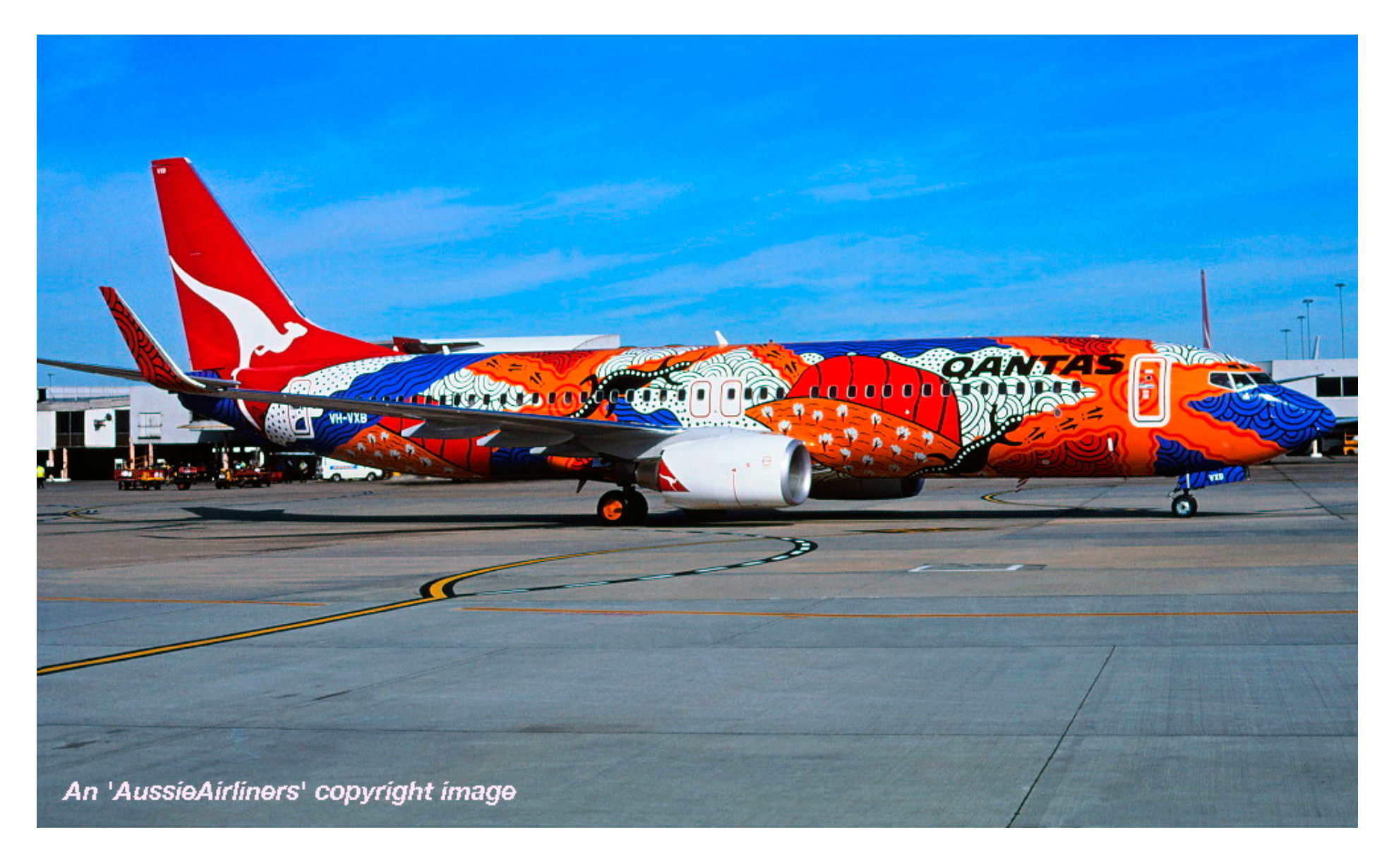
VH-VXB 'Yananyi Dreaming' in the aboriginal livery at Melbourne Tullamarine Airport, November 2002.