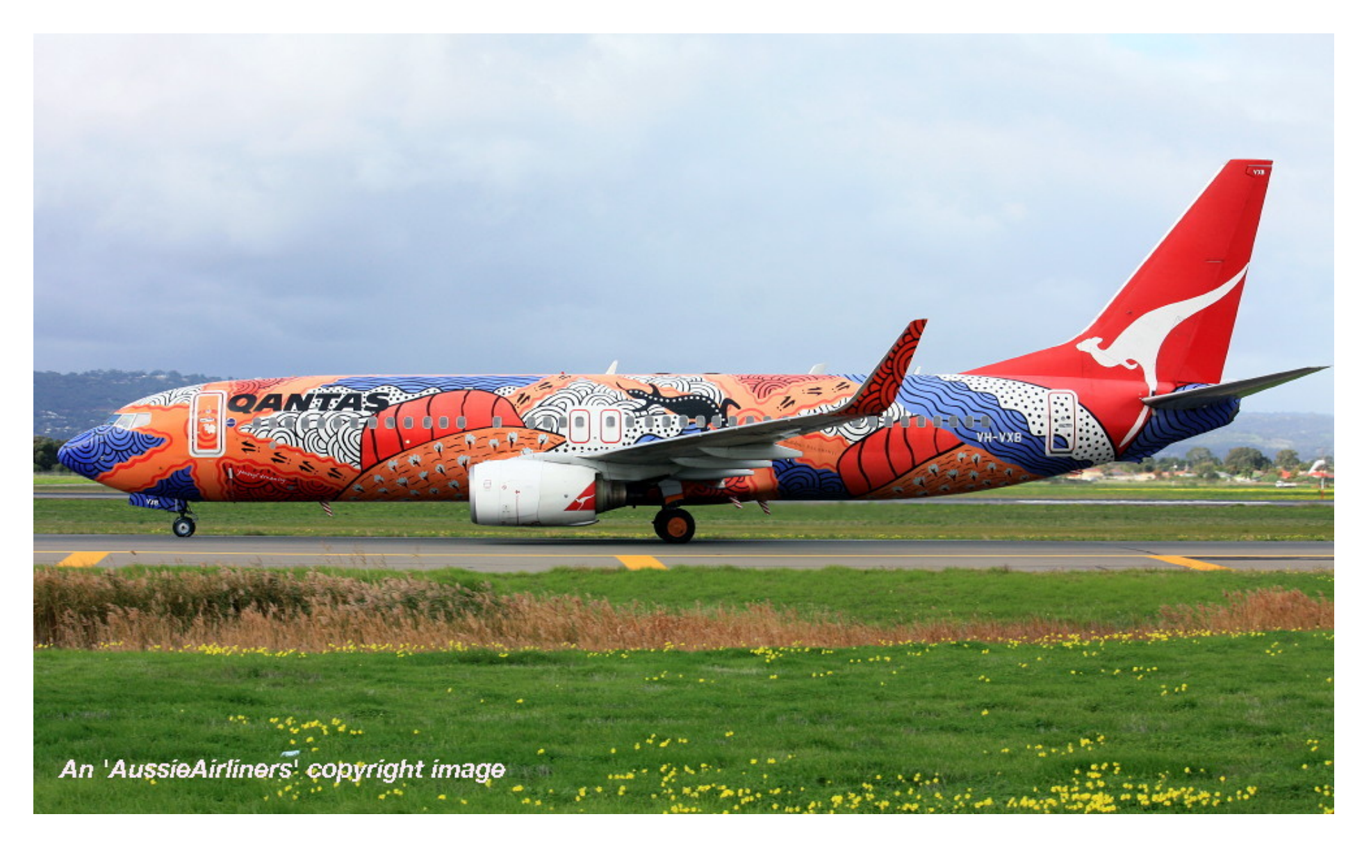
VH-VXB 'Yananyi Dreaming' in the aboriginal livery at Adelaide West Beach Airport, June 14, 2013.