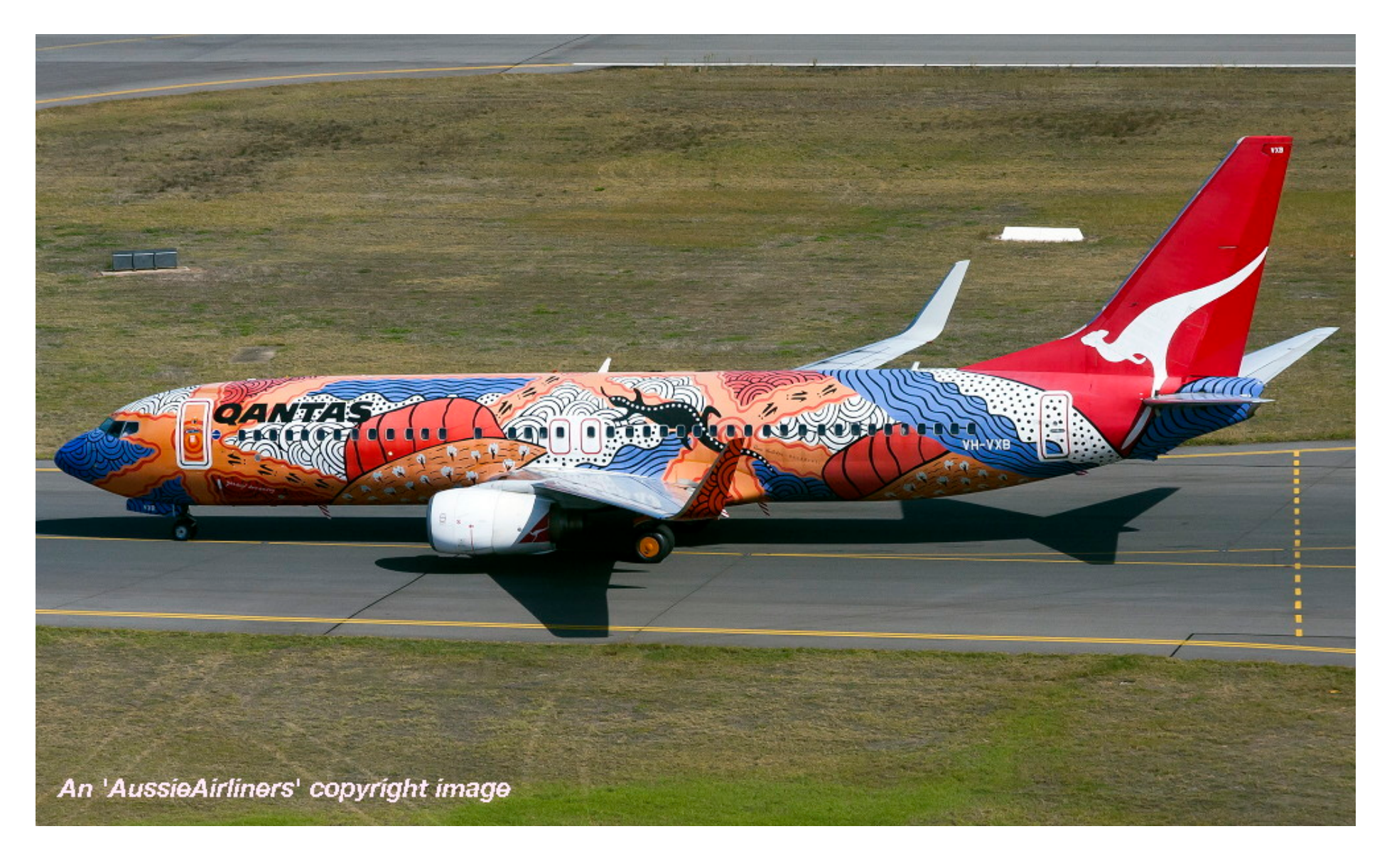
VH-VXB 'Yananyi Dreaming' in the aboriginal livery at Adelaide West Beach Airport, April 20, 2014.