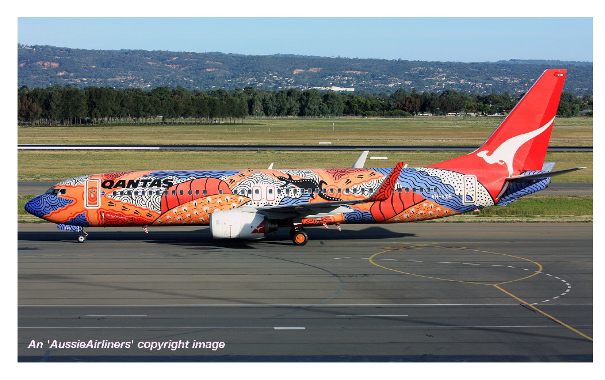
VH-VXB 'Yananyi Dreaming' in the aboriginal livery at Adelaide West Beach Airport, March 22, 2014.