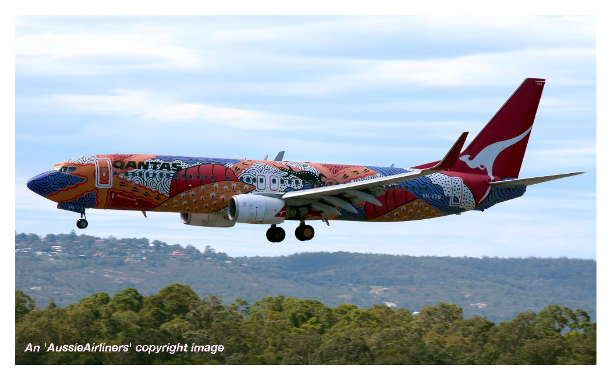
VH-VXB 'Yananyi Dreaming' in the aboriginal livery at Perth Airport, October 24, 2013.