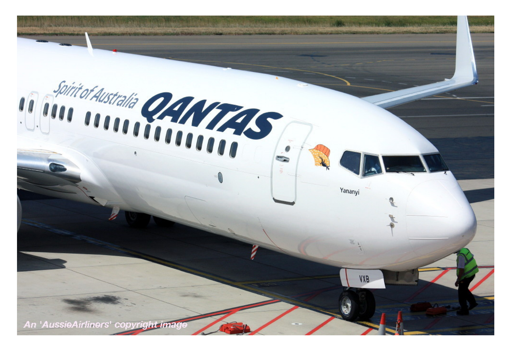
VH-VXB 'Yananyi' in the 'New Roo' livery at Adelaide West Beach Airport, October 22, 2014.