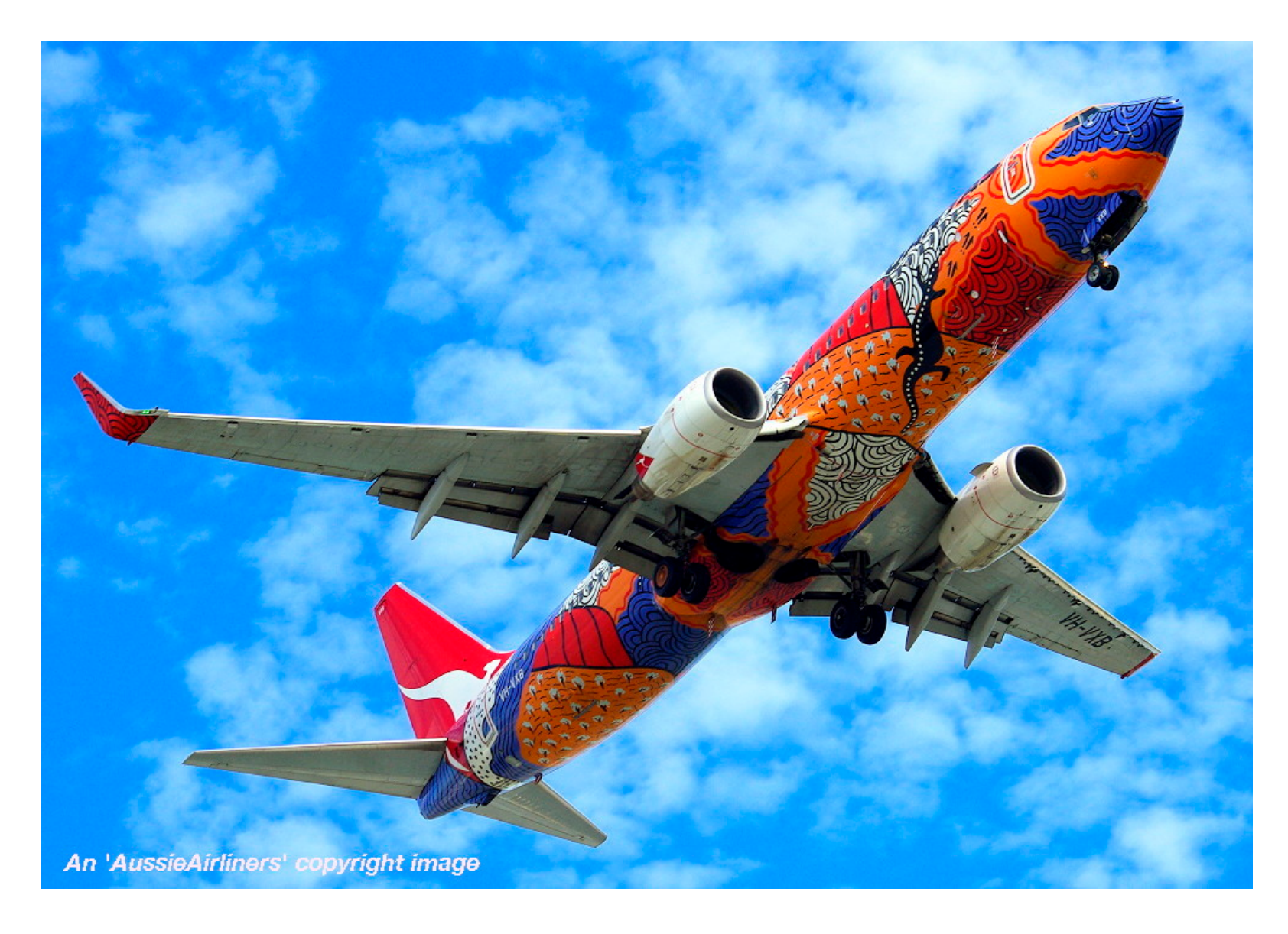
VH-VXB 'Yananyi Dreaming' in the aboriginal livery at Perth Airport, May 20, 2009.